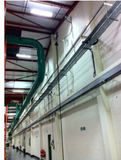
Ground level remote display