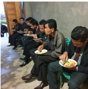
Is there a better place to listen than during a meal? Taken at the 2019 Pastor's conference.

Mentor: As we listen and follow the local leaders we also want to demonstrate by example a strong Christian life dedicated to the Gospel. As we meet with leaders we are active in prayer, worship, and mercy.