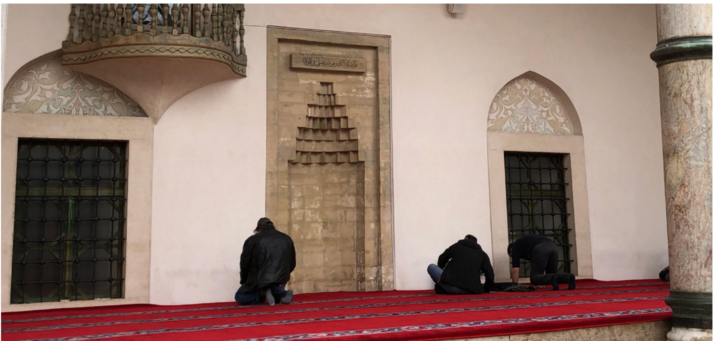
Praying in Sarajevo.

One of my main issues with these books is that they are not attractive to mainstream Muslims. Most of us sitting here are probably able to have a discussion but you need to have some form of intellectual basis to have that discussion. So I have never seen some of those discussions amongst mainstream Muslims in the mosques.