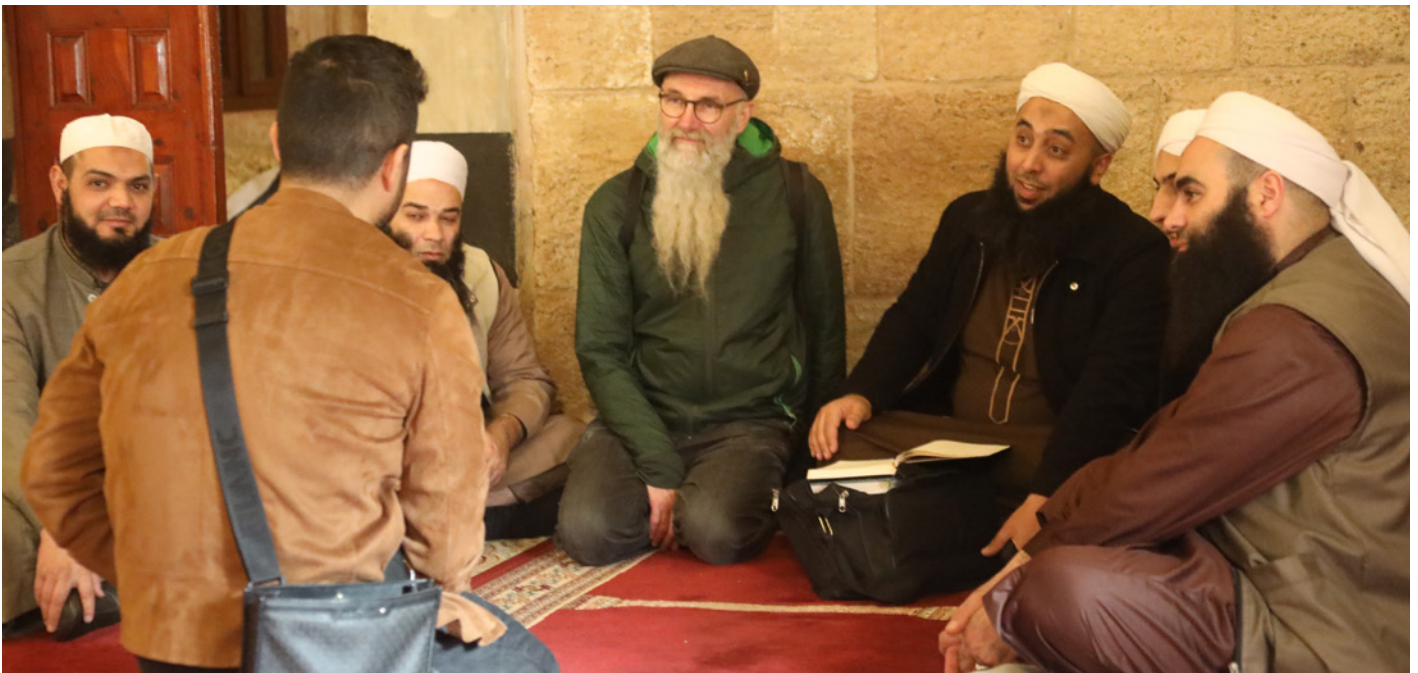
Moment of exchange at the Taynal Mosque when the Lokahi Global Exchange visited.

THEY DON'T HAVE TO USE NEW ANSWERS. ISLAM IS ISLAM. FROM 300 YEARS AGO AND NOW IS THE SAME.