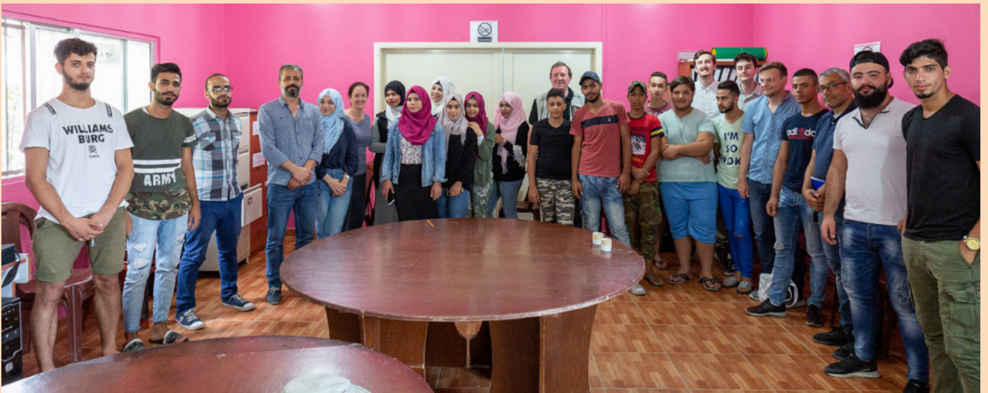
Young Palestinian refugees in the 'Ain al-Hilweh refugee camp welcome the Lokahi research team.

Major points of learning, for future exploration: creating religious dialogue on the ground in situations of serious conflict; engaging religious leaders and winning support from high-level religious authorities; putting the empowerment of women as an enabling priority in an Islamic institution.