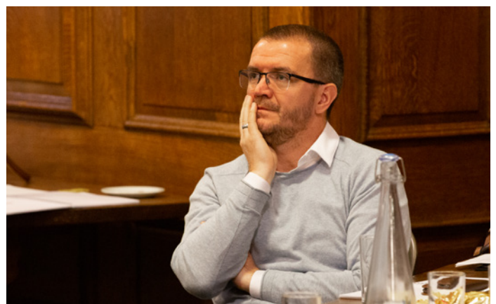
Lokahi Global Exchange participant in London

MUSLIMS BELIEVE IN THE SAME ISLAM – BUT THE CORE NOTIONS MEAN SUBTLY DIFFERENT THINGS TO MUSLIMS IN DIFFERENT PARTS OF THE WORLD.