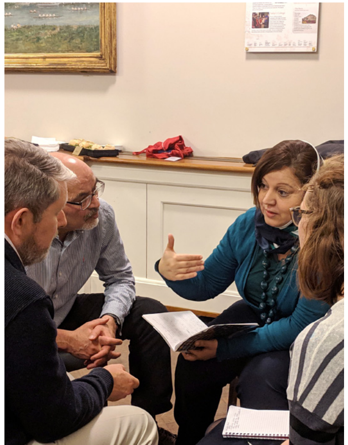
Making a point at the Education Roundtable.