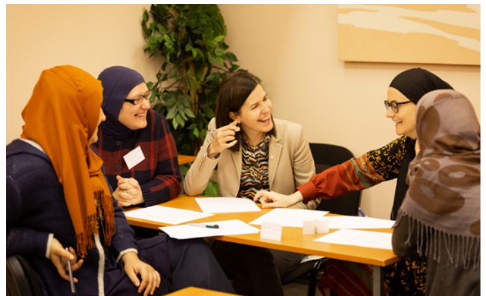
Spirited discussion at the Sofia Symposium.

On visits to non-governmental organisations, Lokahi researchers analysed the ways in which they engage with religion – as a leadership structure, social force, or source of inspiration and guidance for their work – and the lessons to be drawn from their attempts to build strong relationships between diverse groups.