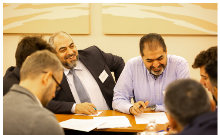
Participants from four countries around a table at the Sofia Symposium.