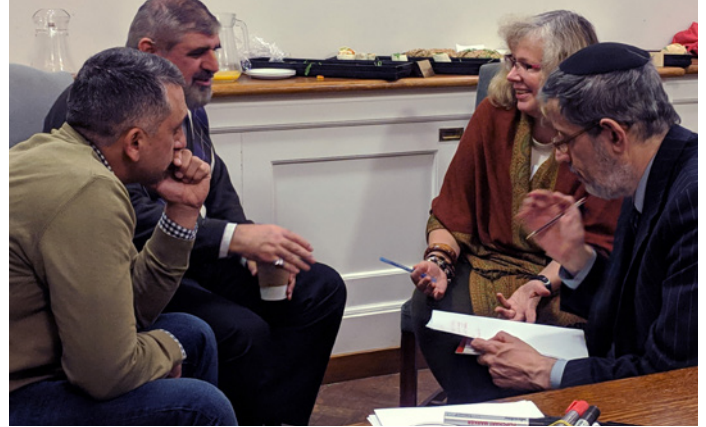
Debate at the Education Roundtable.

At a midpoint in the work, we identified a key strategy for furthering the aim of fostering social inclusion with respect to religion and belief. A carefully-designed international exchange between people working on similar problems would enable a step change and transform the landscape. After this, two pilot events were designed to test the concept in practice, and a third workshop focused on models of international exchange and practical dimensions of implementing exchange activities.