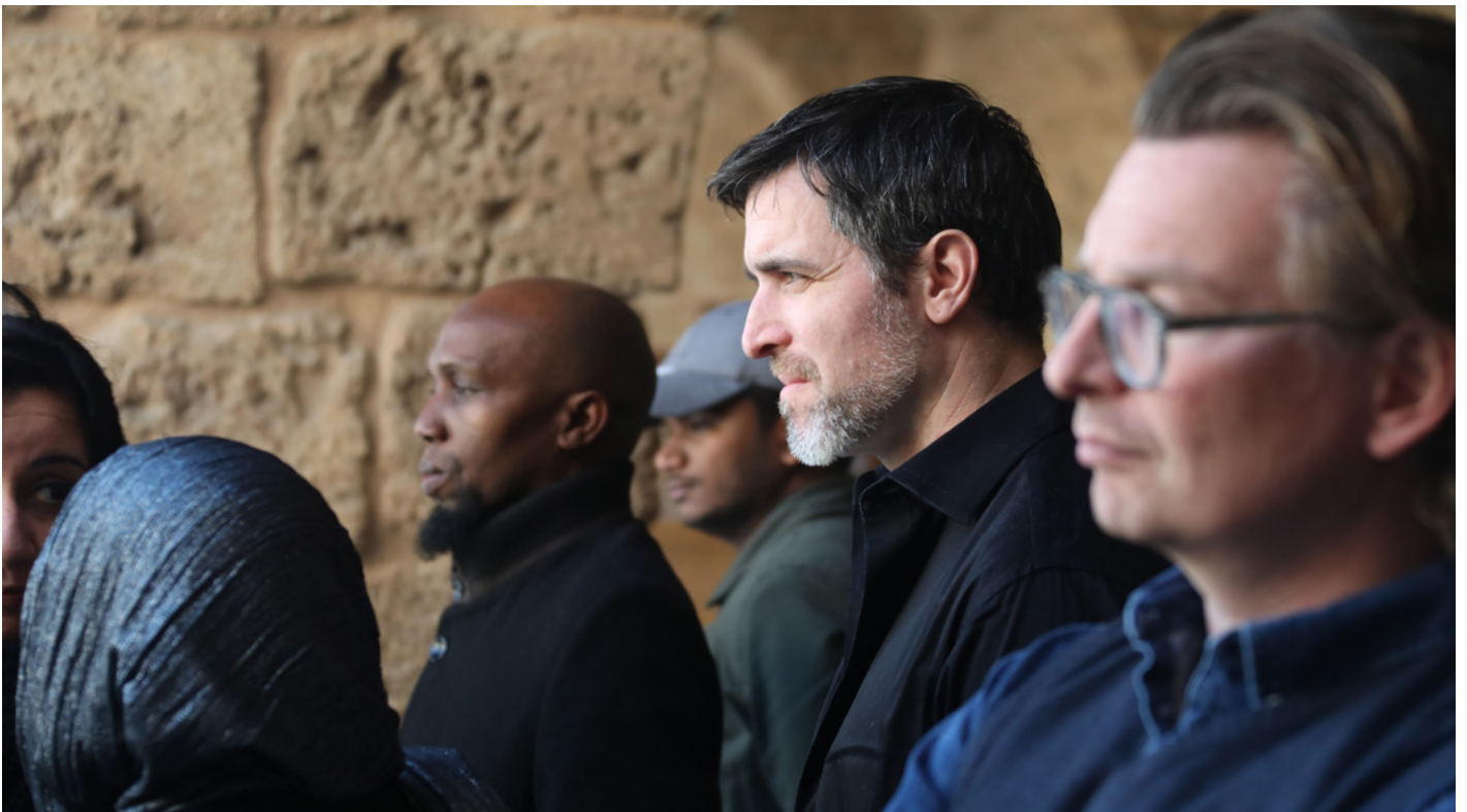
Lokahi Global Exchange visiting Tripoli.

How shall we understand Islam, as a faith or way of life that grows organically from the European Muslim experience; speaks to the specific challenges faced by Muslim communities in European societies; maintains a strong connection to Islamic tradition and the wider Muslim world internationally; relates with empathy to other faiths and understands secular norms and the rule of law?