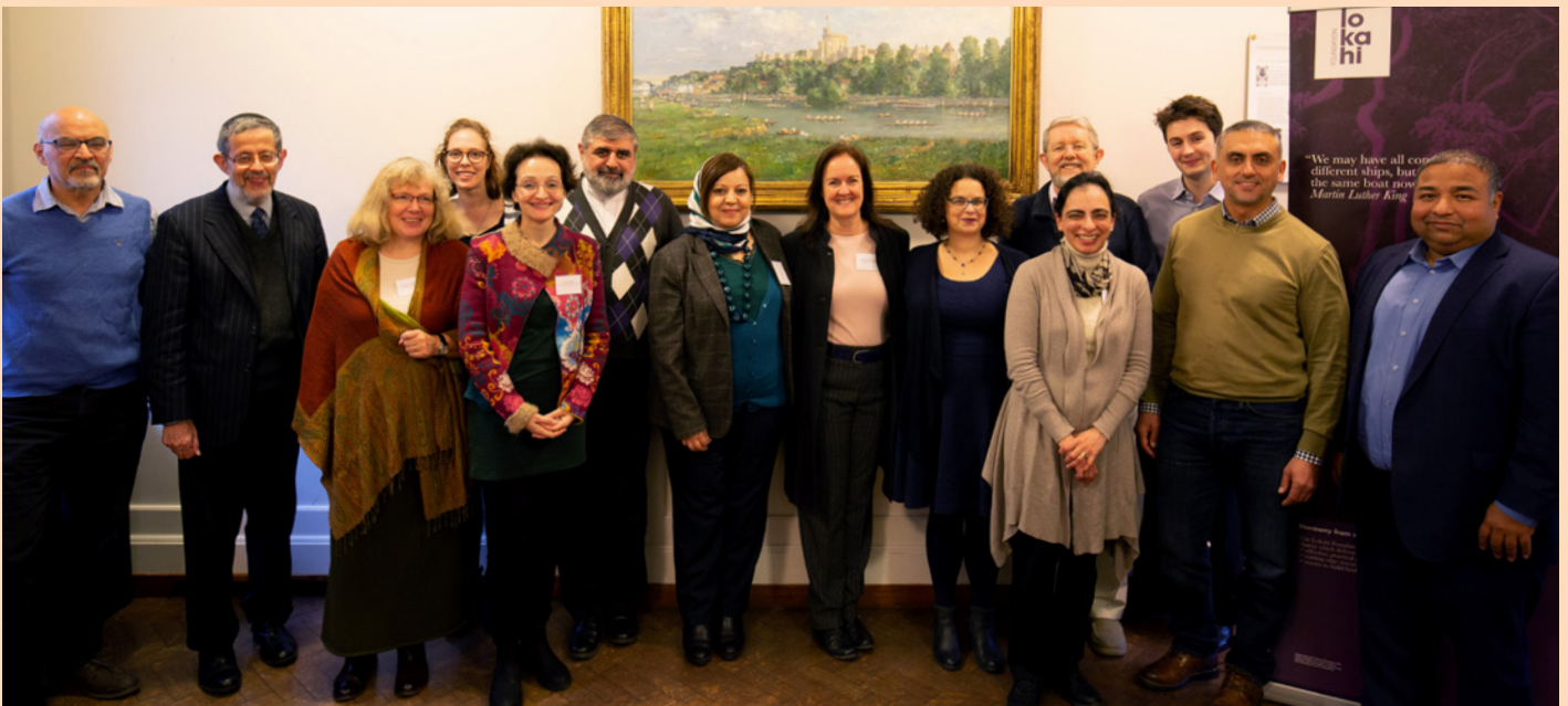
Education Roundtable, November 2018.

Major points of learning, for future exploration: governments often overlook higher education in religion, but it has a critical role to play in building social cohesion and should be part of the conversation; adult education of communities should include a focus on inclusion; we should encourage religious communities to join forces in adult education.