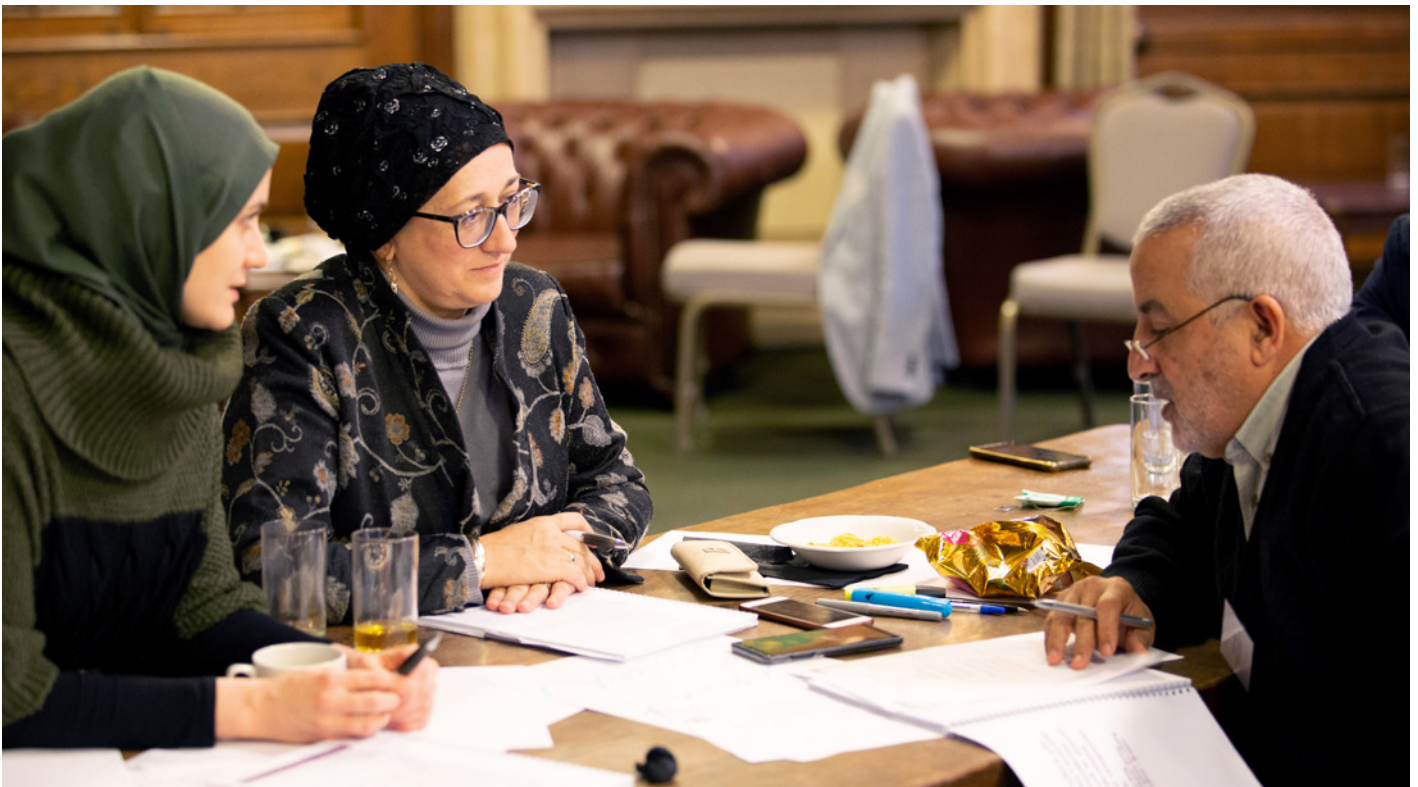
Masterminding at the London Lokahi Global Exchange.

This shared longing was not exclusive either to 'progressives' or to 'conservatives'; it is not itself an issue that divides traditional from liberal Muslims and it does not in their view entail watering down the requirements of Islam.