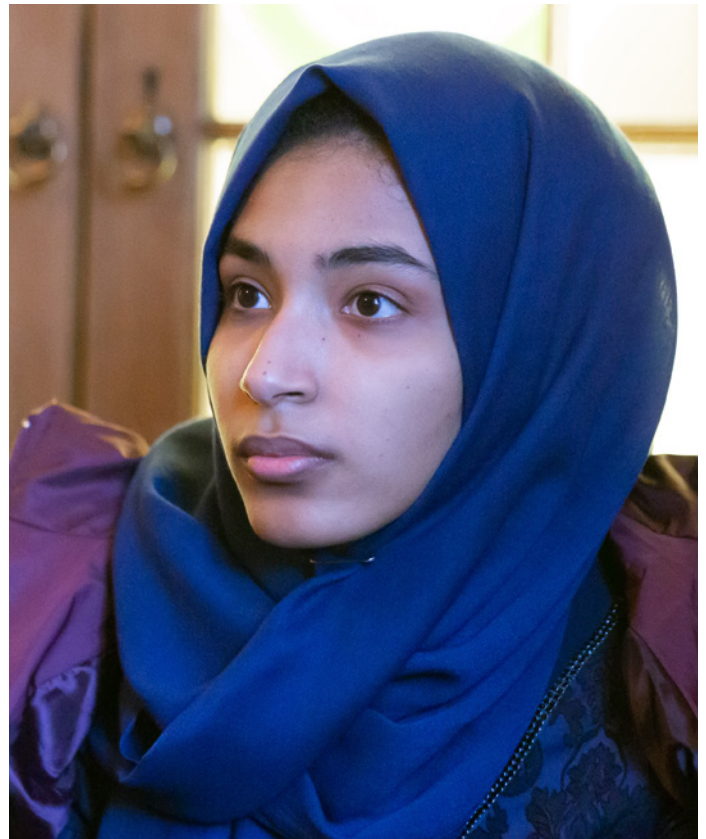
Lokahi Global Exchange participant

Terrorism and extremism were not at the forefront of concerns of our focus group participants, despite the undeniable impact of this issue on Muslim communities. When they volunteered their views, respondents consistently expressed anxieties both for religious reasons – that these acts and beliefs are the very opposite of true Islam – and for personal security. The other factor frequently mentioned was the impact of security concerns on Muslim communities: heightening suspicion; making it dangerous to wear Islamic or cultural clothing, state your identity, or pray or otherwise practice openly; and in increasing the alienation, discrimination and the hostility experienced from others.