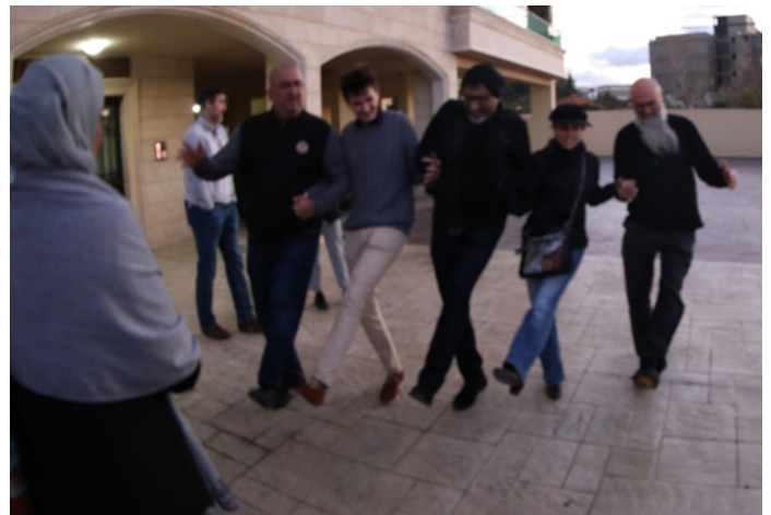
Spontaneous interfaith Lokahi-dance in Saida, Lebanon.

Our focus groups and interviews also highlighted how often Muslims and citizens of other faiths forge alliances for a common cause; examples include Muslims and Jews joining forces to express concern about sex education in schools, Sikhs building bridges with Catholics to oppose abortion.