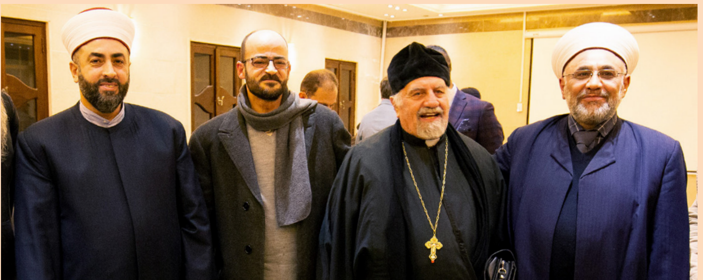
Members of the DLR in Tripoli hosting a visit from the Lokahi Global Exchange.

Religious leaders have built up strong personal ties of friendship and are able to not only discuss matters of social concern, but draw on each other for advice and expertise when delivering interreligious education. Significantly, the Orthodox Patriarch, the Mufti of Tripoli and the North, and Maronite Bishop in Tripoli have all supported this project, allowing the network to overcome any resistance from social media or local spoilers.