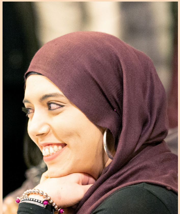
Lokahi Global Exchange participant in London

Religious actors already collaborate for shared goals in social change. Where the European Union is uniquely placed to add value is to upscale this phenomenon at the international level; empowering those striving to tackle ‘wicked problems’ in society to connect, learn from each other, and accelerate success towards important goals such as the Sustainable Development Goals.