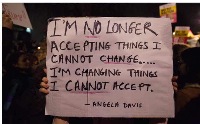
Sign at a London demonstration.

Muslim communities still face a lot of discrimination and social inequalities. So they avoid any contact with society as much as possible. Unfortunately, from the moment someone feels they are being rejected, they become socially and religiously fragile.