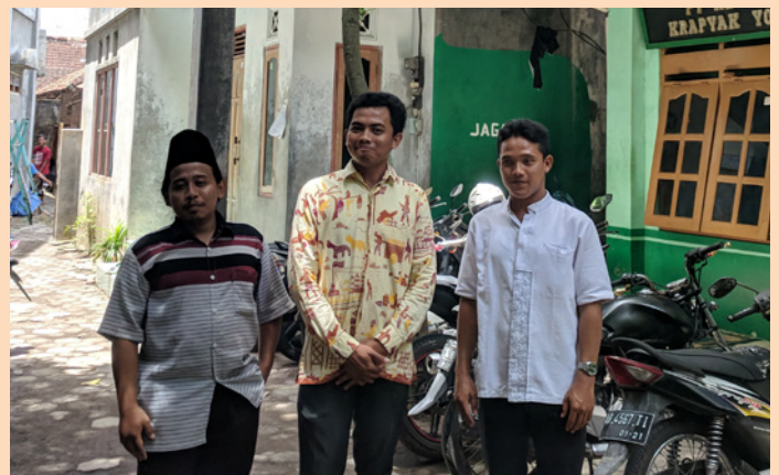
Pesantren in Yogyakarta.