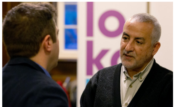
Conversation at the London Lokahi Global Exchange.

WE'VE HAD COUNTLESS EXAMPLES OF PEOPLE ASKING A QUESTION IN THE WEST AND GETTING AN ANSWER FROM THE EAST.