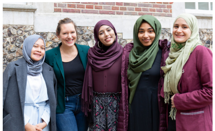
Lokahi Global Exchange participants in London

I SEE MYSELF AS GERMAN. AND MY PARENTS SEE THEMSELVES AS ARABIC.