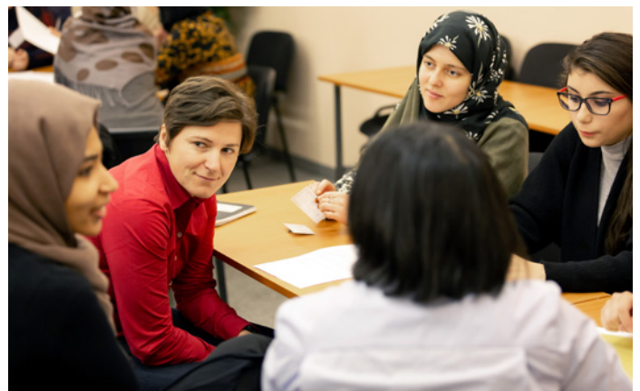
Sharing at the Sofia Symposium.

There are of course very gendered elements to the discussion around identity. Female Muslims can often find themselves at the forefront of the debates, whether they are visible because of dress or they choose not to adopt dress that makes them stand out. Alongside this, there is a secondary dimension to exploring one's identity in (often) socially and culturally conservative settings where there may be particular framings of the expectations of women and their roles in public life.