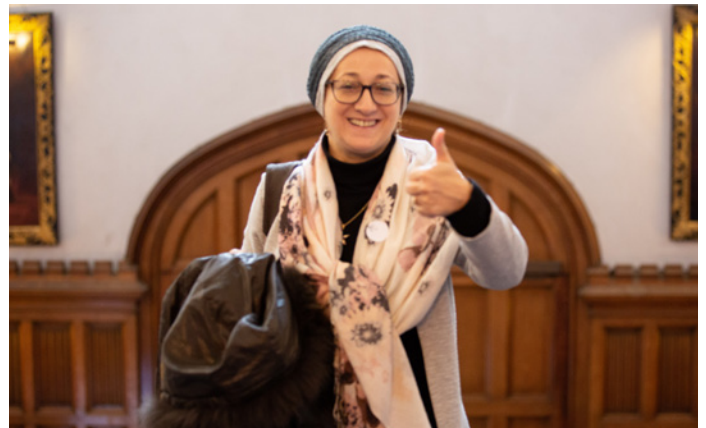
Lokahi Global Exchange participant in London

In order to look at contemporary dynamics within Islam in diverse societies, the research activities focused on a number of countries and explored what is needed to successfully develop an understanding of Islam that grows organically from the European Muslim experience; one that speaks to the specific challenges faced by Muslim communities in European societies, while also maintaining a strong connection to Islamic tradition and the wider Muslim world internationally.