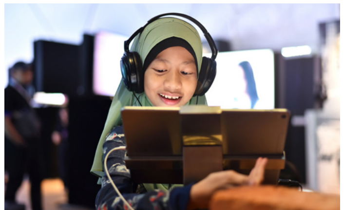
Finding Imam YouTube

WHO CAN I RELATE TO? AND THEN THEY MIGHT FIND SHEIKH GOOGLE, AND IT MIGHT BE A GOOD LESSON – OR NOT.