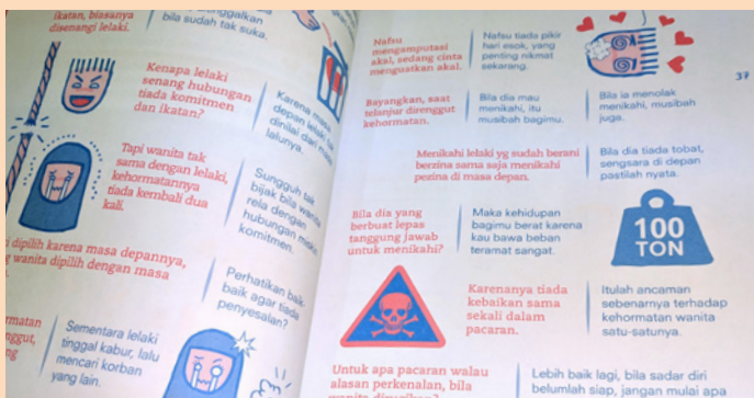
Indonesian book urging girls not to have boyfriends.

Recent years have seen a significant incursion of these ‘outside’ Islamic movements into Indonesia. Interviewees suggested the local response had been complacent and they were only just waking up to its extent and impact. They are now making a somewhat belated, energetic effort to win back the youth, and to support ulema and preachers with materials to support and improve preaching at Friday services.