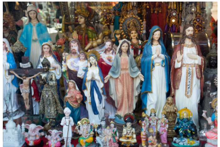
Shop window in Southall, London.

When Islam becomes inclusive in Europe, it becomes resilient; when Islam is resilient, European societies in turn become more resilient, more inclusive, and more sustainable.