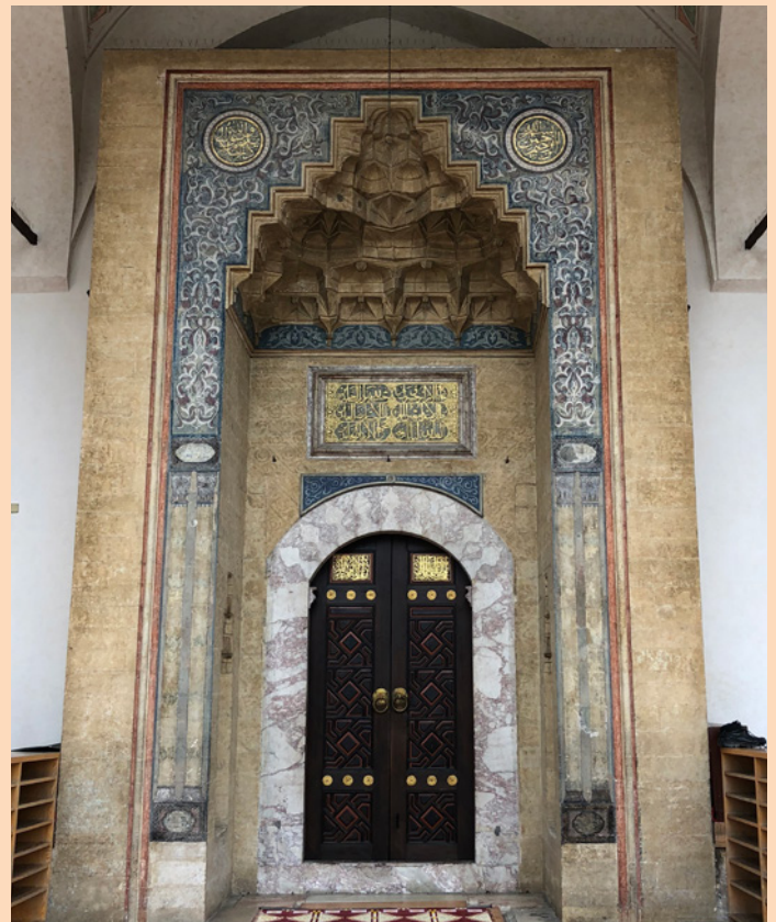
Ghazi Husrev-Beg Mosque, Sarajevo.

Major points of learning, for future exploration: the experience of indigenous or autochthonous Islam in Europe; the advantages and disadvantages of centralised institutional religious authority; responses to religious influences from outside the region.