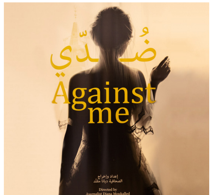
Derived from the poster for 'Against Me', a play promoted by Kafa in Lebanon

Our society lacks respect towards Muslim women who want to practice Islam and still want to be active in this society. If I go on a debate, either on the news or the radio or newspapers, and I represent myself, they will start to attack me. They still see wearing the hijab as a symbol of oppression.