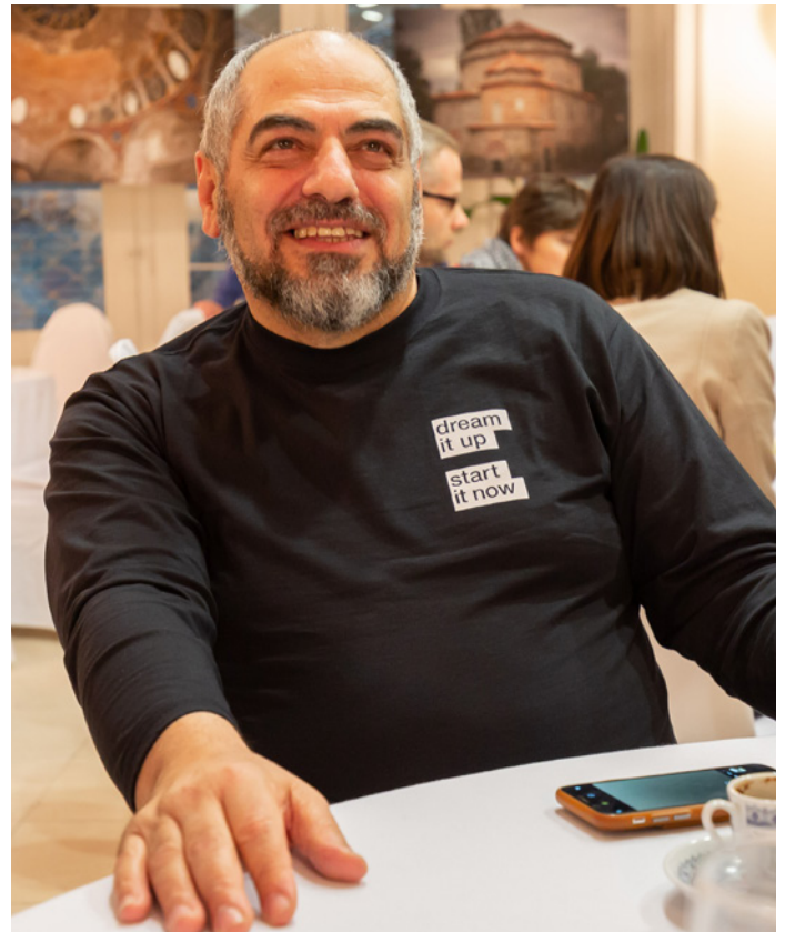
Participant at the Sofia Symposium.

While Muslim communities have been settling in the European landscape, the context itself has been changing. We are therefore dealing with a very complex dynamic of influences – inter alia , migration, settlement, social and economic upheaval post-WWII, as well as globalising influences. In more recent years we have seen the rise of polarisation across Europe that has challenged our notion of how much migration European society could and should sustain. Some of this pointing to Muslims (as well as others) as highly visible manifestations of the ‘Other’, often linked to a perception of being a source of threat (for example, terrorism or social/cultural/political challenge). Clearly the navigation of such a terrain is not easy and if we consider that migrant communities to Europe have often been from the poorest strata of their countries of origin, with low levels of social and educational capital, the enormity of the task begins to dawn upon us.