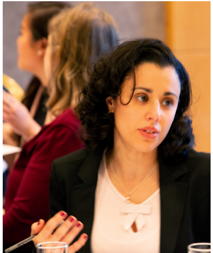
Lokahi Global Exchange participant in Lebanon

WE HEARD A RECURRING THEME: 'NO-ONE IS LISTENING TO US.'