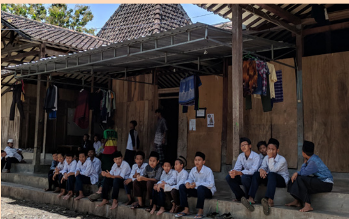
Pesantren in Yogyakarta.

Major points of learning, for future exploration: the powerful impact of youth cultural and 'production values' in communicating religious messages; the potential of intellectual exchange based on the foundation of a shared theological approach to interpretation; positive interaction and support between academics and preachers.