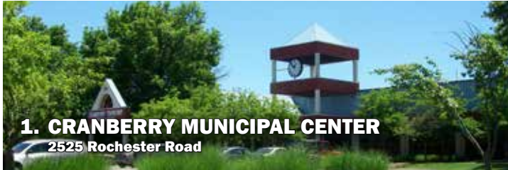
1. CRANBERRY MUNICIPAL CENTER 2525 Rochester Road

Cranberry offers a wide range of facilities, recreational programs, activities and events. Enjoy 3 major parks, waterpark, disc golf, skatepark, dog park, public golf course, 15 miles of marked bikeways, 25+ miles of trails, and 150+ miles of sidewalks!