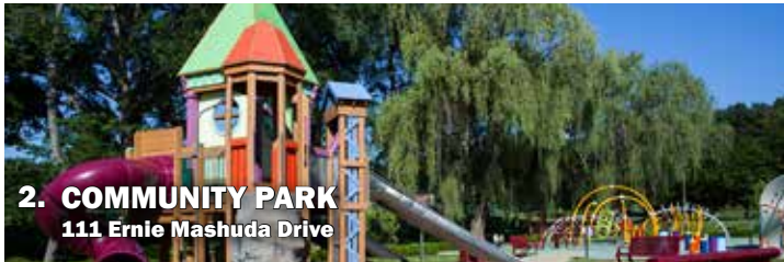
2. COMMUNITY PARK 111 Ernie Mashuda Drive