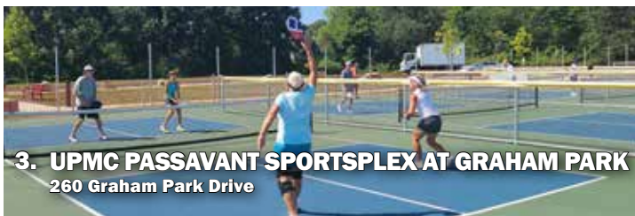
3. UPMC PASSAVANT SPORTSPLEX AT GRAHAM PARK 260 Graham Park Drive