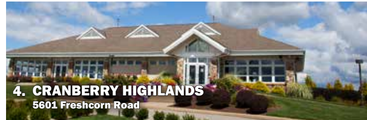
4. CRANBERRY HIGHLANDS 5601 Freshcorn Road

Cranberry offers a variety of meeting rooms, multipurpose rooms, a gymnasium, and park shelters for community use. Rental fees apply. Visit Cranberry4FUN/FacilityRental for more information.