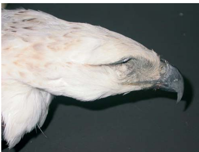
Plate 1b. Head of floris .