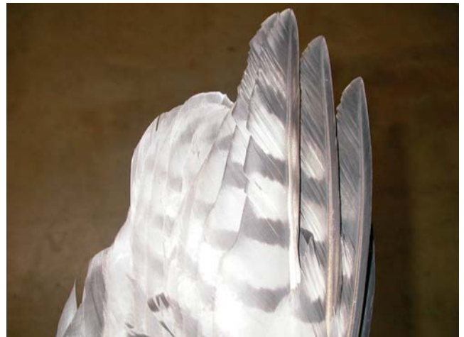
Plate 2d. Primaries of adult limnaetus .