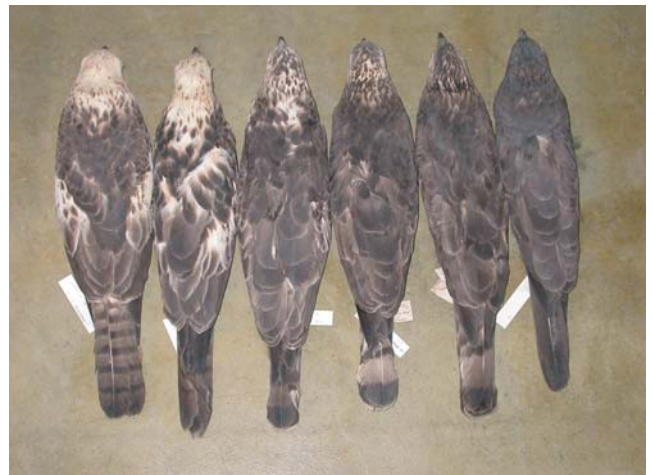
Plate 2e. Variation in limnaetus , dorsal side. The two birds to left are juveniles.