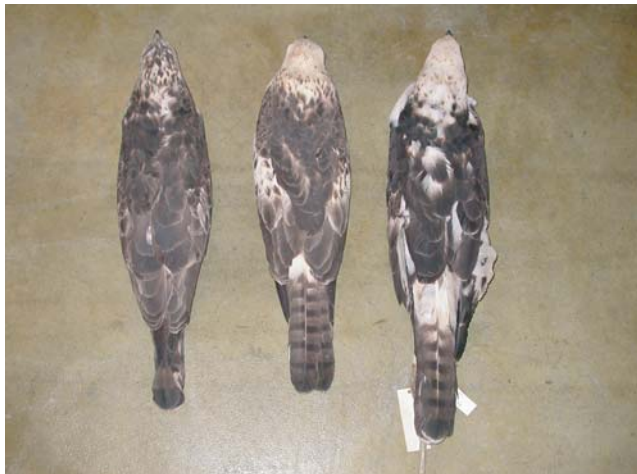
Plate 2b. Dorsal side of the same birds.