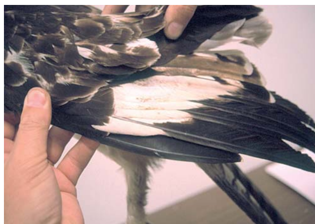
Plate 1c. Wing-patch of adult floris .