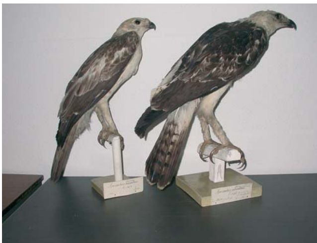
Plate 1a. Adult floris (right), juvenile limnaeetus (left).