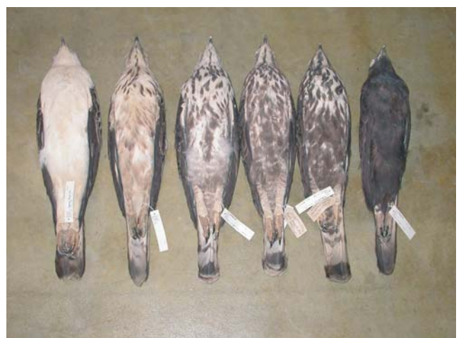
Plate 2f. Ventral side of the same birds.