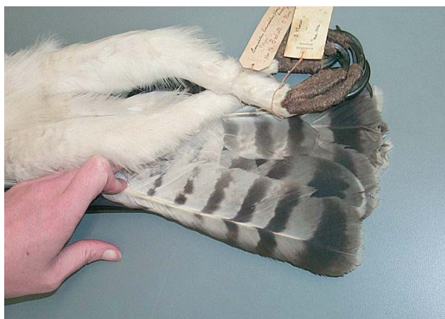
Plate 1f. Tail of adult floris .