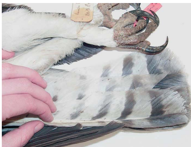
Plate 1e. Tail of juvenile floris .