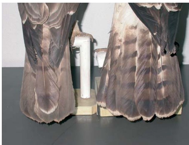
Plate 1d. Tail of adult floris (right) and juvenile limnaeetus in moult (left).