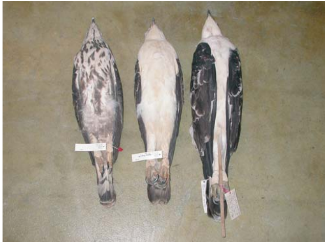
Plate 2a. Ventral side of adult floris (right), juvenile limnaetus (middle) and adult limnaetus (left).