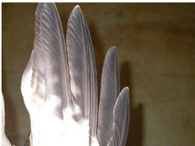
Plate 2c. Primaries of adult floris .