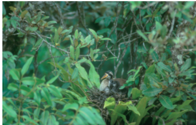
Plate 5. Chicks (note bill marked with tiny white spot at the top) besides adult female Masked Finfoot on the nest, 25 August 2004.