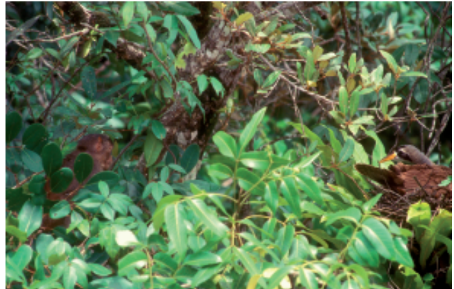
Plate 6. Female Masked Finfoot on the nest in gesture of defence during approach of a Rhesus Macaque (on the left), 24 August 2004. (E. and R. Fahrni Mansur)