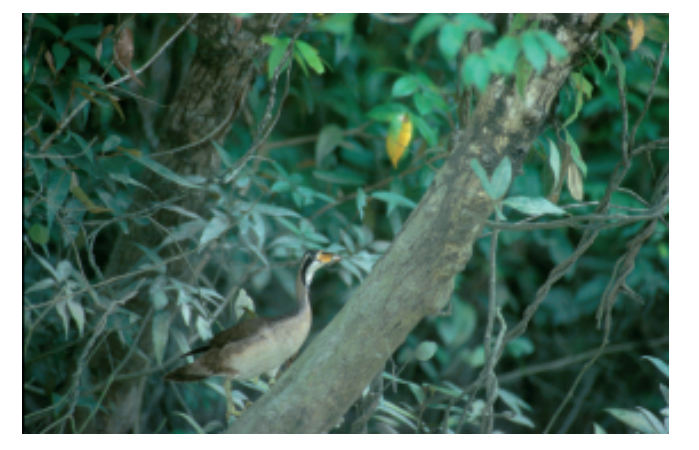
Plate 3. Female Masked Finfoot climbing the nesting tree with small fish in bill for feeding the chicks, 25 August 2004. (G. and H. Denzau).