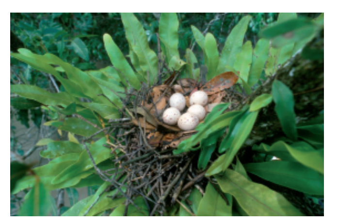
Plate 1. Nest #16 with eggs of Masked Finfoot built in the centre of an Asplenium fern, 21 August 2004. (G. and H. Denzau)

When returning to the nest (N=21), the female always approached on foot, either by walking up the slanting trunk of the nesting tree or by climbing up a higher neighbouring tree and jumping down, landing just beside the nest. There are no previous records of this behaviour. While climbing up to the nest, she stopped frequently to sort her feathers meticulously. The bird always returned to the nest before rain started. It removed raindrops from its feathers with a slight shaking of neck and body.