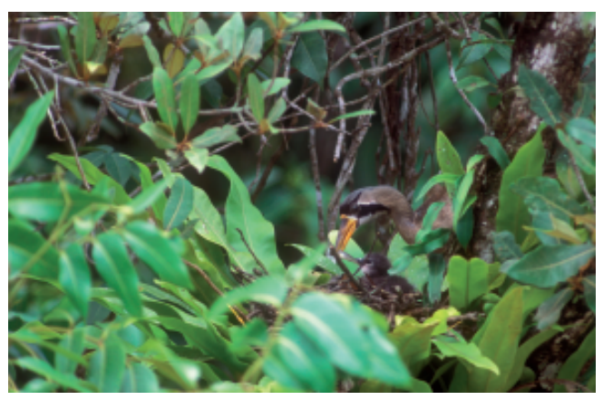
Plate 4. Female Masked Finfoot on the nest offering a fish (tail first) to a chick, 25 August 2004.

On 24 August 2004 at 10h43 the incubating female started to poke at the eggs, and ate the smallest fragments of the eggshells (six times during the following 7 hours 17 minutes of observation). By evening, the eggs showed visible cracks and small holes. The female bird was observed trying to open them, but none broke open before nightfall. In the morning of 25 August three chicks had hatched. The two remaining eggs, possibly infertile, remained intact and were left unnoticed in the nest.