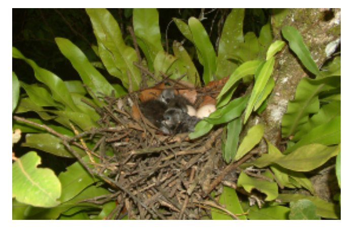
Plate 2. Three freshly hatched Masked Finfoot chicks beside two unfertile eggs, 25 August 2004. (E. and R. Fahrni Mansur)