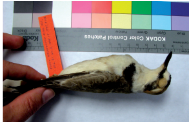
Plate 2. Type specimen of Charadrius alexandrinus nihonensis described by Deignan (1941), and held in US National Museum, Washington DC, USA (USNM 95938), collected by Captain T. W. Blakiston at Aomori, Hondo [Honshu], Japan, on 23 April 1876. Birds assigned to this form closely resemble the nominate race of Kentish Plover but are distinguished by a slightly heavier bill structure, marginally darker upperparts and a richer cinnamon-orange crown.

Deignan also noted, however, that birds taken in China to the north of the range of dealbatus are 'dark backed and have a bill somewhat smaller than nihonensis but nevertheless larger than alexandrinus '. While recognising there is substantial variation in bill size in Kentish Plover, and also that young birds tend to have smaller bills than