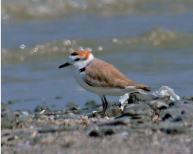
Plate 3. Adult male Charadrius [alexandrinus] dealbatus , breeding plumage (early February onwards), Tanjung Tokong, Penang, Malaysia, 6 February 2007. (David Bakewell)