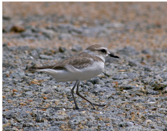
Plate 7. Presumed adult female Charadrius [alexandrinus] dealbatus , non-breeding plumage (October to late December), Tanjung Tokong, Penang, Malaysia, 21 November 2007.