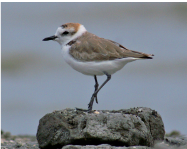
Plate 5. Presumed first-summer male Charadrius [alexandrinus] dealbatus , breeding plumage (early February onwards), Tanjung Tokong, Penang, Malaysia, 6 February 2007. (David Bakewell)