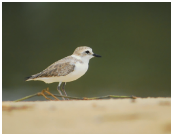
Plate 8. Presumed juvenile Charadrius [alexandrinus] dealbatus , Karon Beach, Phuket, Thailand, 15 November 2003. (Petteri Lehikoinen)