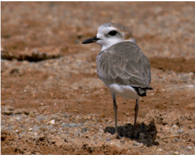
Plate 4. Presumed first-winter male Charadrius [alexandrinus] dealbatus (October to late December), Tanjung Tokong, Penang, Malaysia, 24 November 2007. (David Bakewell)