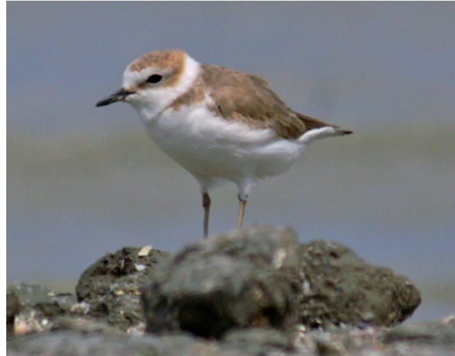
Plate 6. Adult female Charadrius [alexandrinus] dealbatus , breeding plumage (early February onwards), Tanjung Tokong, Penang, Malaysia, 6 February 2007.