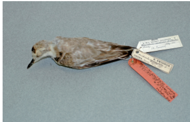
Plate 1. Lectotype of Aegialites [ Charadrius (alexandrinus) ] dealbatus held in NHM, Tring, (BMNH 96.7.1.559), collected by Robert Swinhoe at Amoy [Xiamen, Fujian province, China] in May 1861. In all plumages, this taxon is characterised by its pale legs and pale base to the lower mandible, larger, heavier bill structure, significantly paler upperparts and longer and more conspicuous wing bar, particularly across the inner primaries, than Kentish Plover.