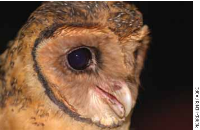
Plate 5. Seram Masked Owl Tyto almae caught at 1,350 m on Gn Binaiya, Seram, 10 February 2012.