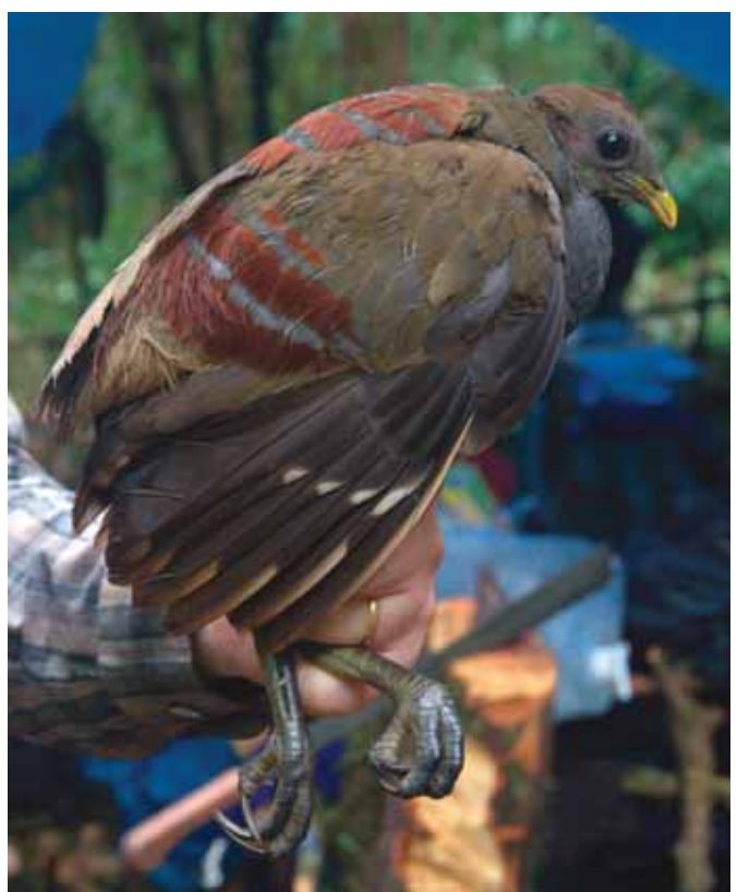
Plate 4. Moluccan Megapode Eulipoa wallacei caught at 1,000 m on Gn Binaiya, Seram, 8 February 2012.