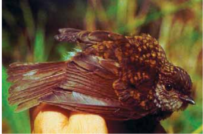
Plate 3 . Streaky-breasted Jungle Flycatcher Rhinomyias additus juvenile caught inland from Fogi, Buru, October 1995.