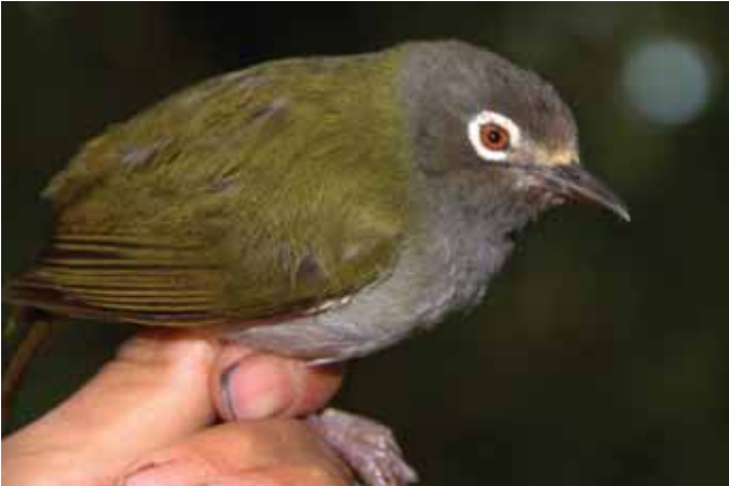
Plate 10. Grey-hooded White-eye Lophozosterops pinaiae caught at

1,370 m on Gn Binaiya, Seram, 14 February 2012.