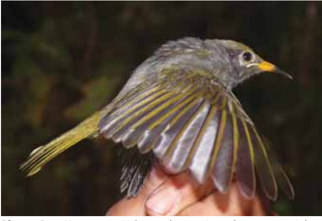
Plate 1. Buru Honeyeater Lichmera deningeri caught at 1,440 m inland from Waikeka, Buru, 13 February 2011.