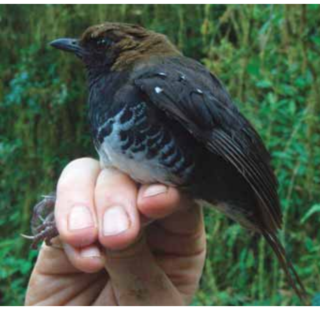
Plate 11. Seram Thrush Zoothera joiceyi female caught at 1,600 m on Gn Binaiya, Seram, 15 February 2012. Note the lack of an eye-ring, the scaled pattern created by the white-edged black feathers of the sides and flanks, the all-black ear-coverts, and the gradation in colour from the rufous-brown crown to the sooty olive-brown mantle, all of which distinguish this species from Buru Thrush (Plate 12). This individual is moulting its white-tipped median wing-coverts, so the single wingbar pattern formed by these is somewhat obscured.