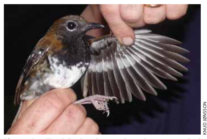
Plate 12. Buru Thrush Zoothera dumasi male caught at 1,100 m inland from Waikeka, Buru, 6 February 2011. The pale eye-ring, brown colouration on the sides and flanks and the partially brown ear-coverts distinguish this species from Seram Thrush Zoothera joiceyi (Plate 11).