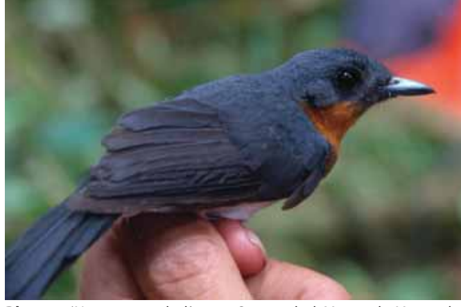
Plate 9. 'Non-spectacled' type Spectacled Monarch Monarcha trivirgatus nigrimentum caught at 1,000 m on Gn Binaiya, Seram, 7 February 2012. Apparent difference in upperparts colouration from bird in Plate 8 is due to lighting.