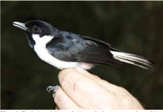
Plate 2. Black-tipped Monarch Monarcha loricatus caught at 700 m inland from Waikeka, Buru, 3 February 2011.