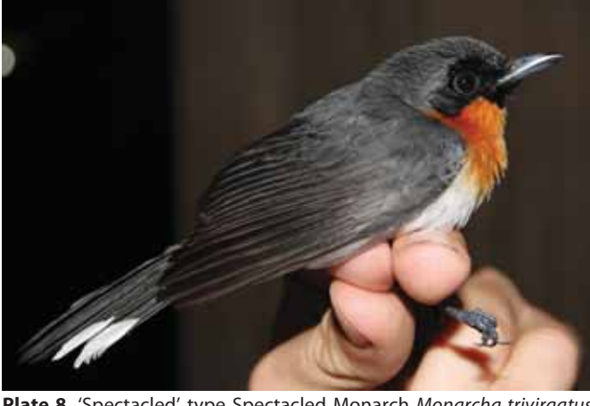
Plate 8. 'Spectacled' type Spectacled Monarch Monarcha trivirgatus nigrimentum caught at 100 m near Sawai, Seram, 1 February 2012.