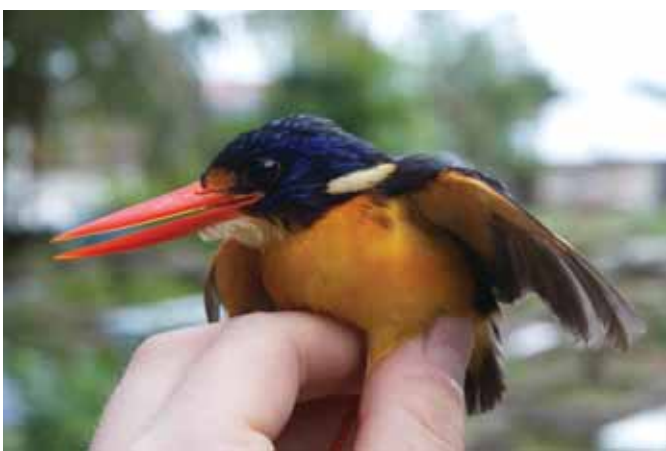
Plate 6. Variable Kingfisher Ceyx lepidus lepidus caught at 150 m near Sawai, Seram, 31 January 2012.