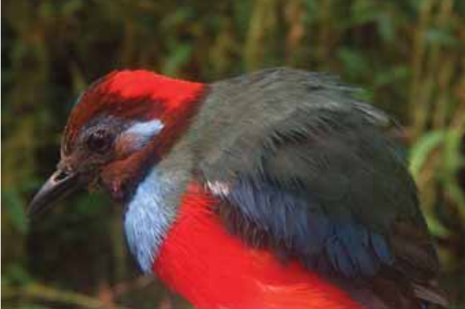
Plate 7. Red-bellied Pitta Pitta erythrogaster piroensis caught at 1,370 on Gn Binaiya, Seram, 15 February 2012.