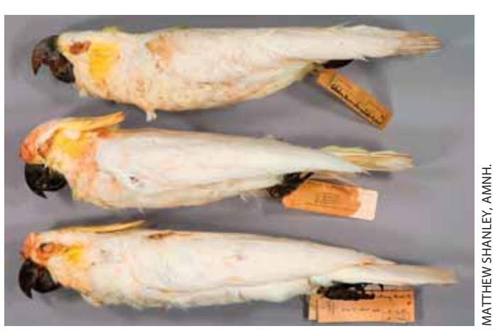
Plate 2. Males of three geographically adjacent taxa of Cacatua sulphurea : top C. s. sulphurea (AMNH 153742—old USNM number visible on label; Kwandang, Sulawesi); middle C. s. djampeana (AMNH 266486; Kayuadi, Tanahjampea); bottom C. s. paulandrewi (AMNH 619651; Wanci, Tukangbesi) type specimen.

Alor birds have not only marginally larger bills than djampeana in its newly restricted sense (males 37.2, n = 3, vs 35.0, n = 3; females 33.3, n = 3, vs 31.6, n = 7) but also considerably smaller (and markedly paler) ear-covert patches (males 22.2, n = 3, vs 28.3, n = 3; females 22.2, n = 3, vs 24.1, n = 7).