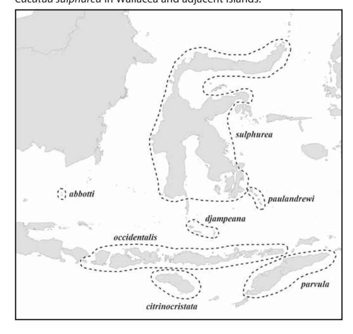
Figure 2. Distribution of the subspecies of Yellow-crested Cockatoo Cacatua sulphurea in Wallacea and adjacent islands.

The distinctiveness of abbotti , in terms of its large size yet relatively small bill, is also of interest. It is something of a biogeographical mystery that the notably remote Masalembu Islands should possess a population of cockatoos in the first place, since these—c.350 km north-west of Lombok and c.250 km west of Wallace's Line—are not included in Wallacea (White & Bruce