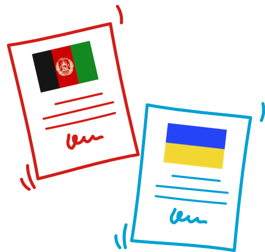
Table 1 on the following page gives an overview of the different family reunion entitlements and mechanisms for people with protection status, Afghans resettled under the ACRS, and Ukrainians in the UK under the Homes for Ukraine scheme and the Ukraine Family Scheme.

This demonstrates the pitfalls of piecemeal policy-making, with a focus on bespoke routes that confer different immigration statuses over a flexible and durable resettlement scheme that confers refugee status and all the essential rights that flow from that protection status.