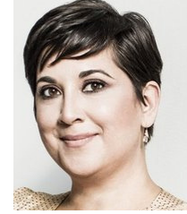
Kamala Sankaram Soprano