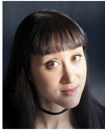
Hai-Ting Chinn Mezzo-Soprano