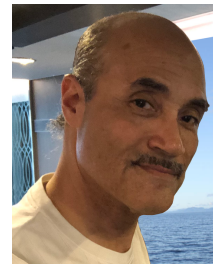
Dwight Howard Arranger / Piano