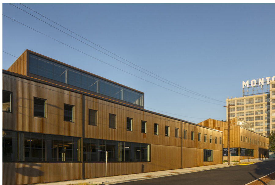
2019 AIA Portland Honor Award: Redfox Commons, LEVER Architecture

On October 25, 2019, AIA Oregon members and friends gathered to celebrate design excellence at Revolution Hall in Portland, Oregon.