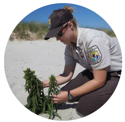
USFWS staff planting Seaside Goldenrod to improve Roseate Tern habitat

A backlog of 200 Comprehensive Conservation Plans (CCP) has also strained the System as funding for planning has largely been eliminated due to budget cuts. Planning is at the core of Refuge System management, but more than 40% of refuges have an outdated CCP or no plan at all. Increased funding for planning and management staff will allow the US Fish and Wildlife Service to begin to address this backlog and provide more of the tools it needs for active water management, habitat management and restoration, and invasive species eradication.