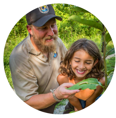
USFWS staff shows a young visitor a Monarch caterpillar on a leaf

Despite only minor increases in funding for the last 13 years, the Refuge System has added 16 new refuge units and hundreds of millions of acres of marine national monuments. It has also added new services, such as the Urban Wildlife Conservation Program launched in 2012 that seeks to address inequalities in recreational access and conservation participation. This program has dramatically changed the way conservation is delivered to communities, and visitor numbers have grown to over 67 million visitors a year--an increase of 36% since FY2010. While the additional acreage, the creation of the urban program, and the increased visitors have enhanced the Refuge System and benefited the communities around these refuges, this growth has also put more pressure on the already stressed and underfunded System.