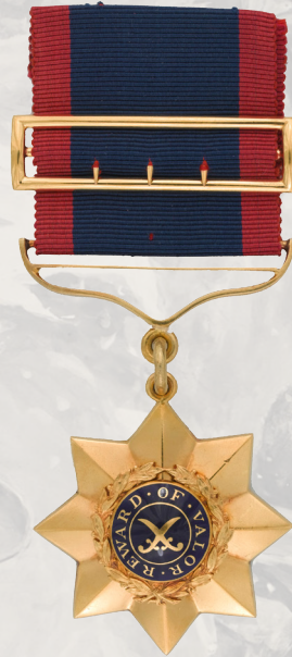
Indian Order of Merit

(Indian Order Of Merit, National Army Museum, London)