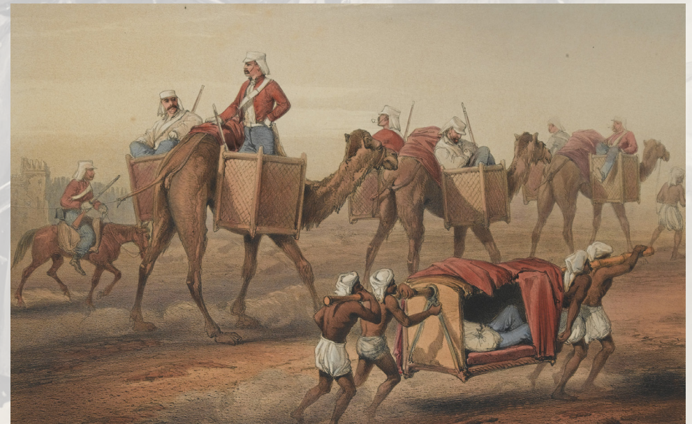
Reinforcement proceeding to Delhi. Coloured lithograph from 'The Campaign in India 1857-58 from drawings made during the eventful period of the Great Mutiny, illustrating the military operations before Delhi and its neighbourhood'. By W Simpson and others, after G F Atkinson, published by Day and Son, 1857-58.

Soldiers mostly came from rural areas and most could not read and write. In return for regular pay and pension they kept peace on the borders of the unruly North West Frontier Province. The British Indian Army numbered some around 195,000 in 1914.