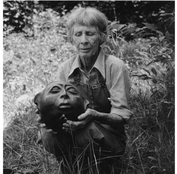
Roger Manley, “Georgia Blizzard, Glade Spring, Virginia” (1985), © 2019 Roger Manley, photo courtesy of Institute 193

In New Orleans, he spots a bumper sticker that warns, “If you don’t like my driving, dial 1-800-EAT-SHIT.” The frisson of hostility proffered by that message hints at an aspect of the broader subject of this book — the social and cultural attitudes and atmosphere of the American South, whose collective character, as anyone who has studied the troubled past of the region is aware, sometimes harbors a dark, disturbing, even sinister side.