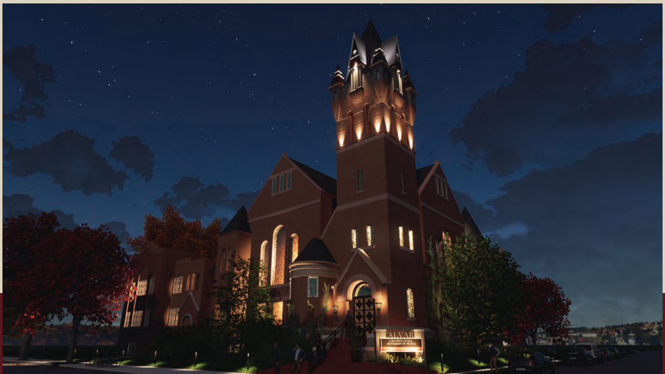
Architect's rendering of a fully-restored and illuminated steeple with lit sidewalks.

Every dollar received ensures physical and financial sustainability for Calvary's people and neighbors for several generations.