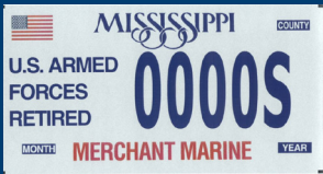
Retired Armed Forces Merchant Marine