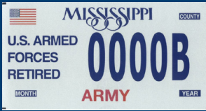
Retired Armed Forces Army