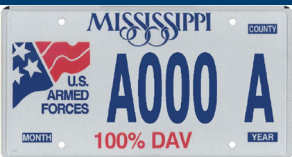
Disabled American Veteran