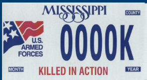
Surviving Spouse of Killed in Action