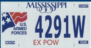
Ex-Prisoner of War