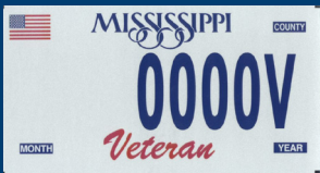
Veteran of the US Armed Forces