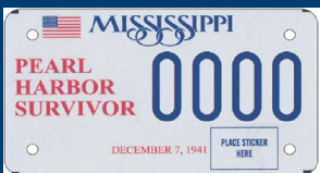
Motorcycle Pearl Harbor