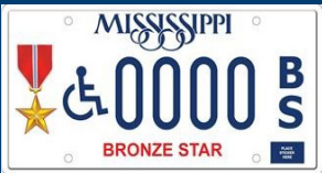
Bronze Star (Disabled)