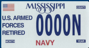
Retired Armed Forces Navy