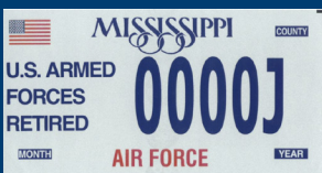
Retired Armed Forces Air Force