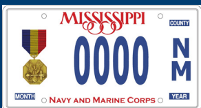
Navy and Marine Corps Medal