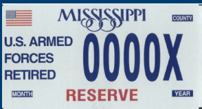
Retired Reserve Armed Forces