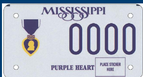
Motorcycle Purple Heart