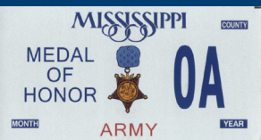
Medal of Honor