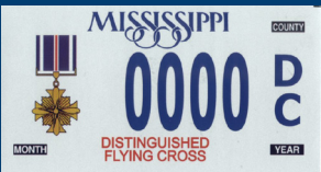
Distinguished Flying Cross Air Medal