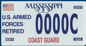
Retired Armed Forces Coast Guard