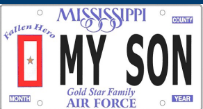
Gold Star Family