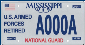
Retired Armed Forces National Guard