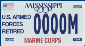
Retired Armed Forces Marine Corps