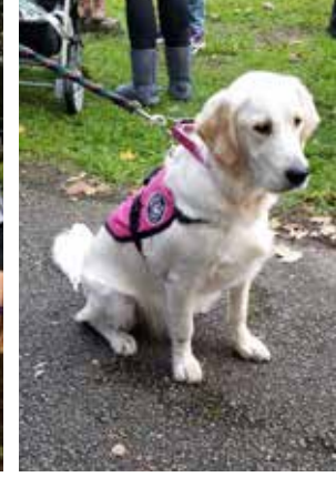
Sophie, Hospice therapy dog