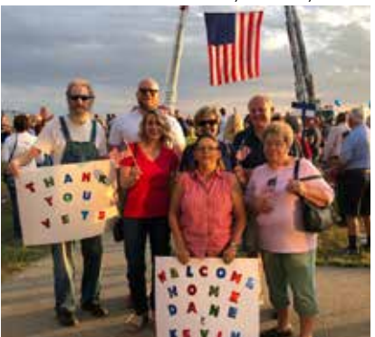
Community Hospice staff, volunteers and friends at the Honor Flight Welcome Home Celebration