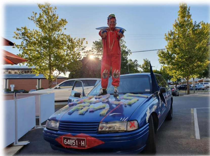
QRG: Sisters Akousmatica. Professional development during Castlemaine Festival 2019

Regional Arts NSW has compiled a very useful 'preparing a budget' resource available here .