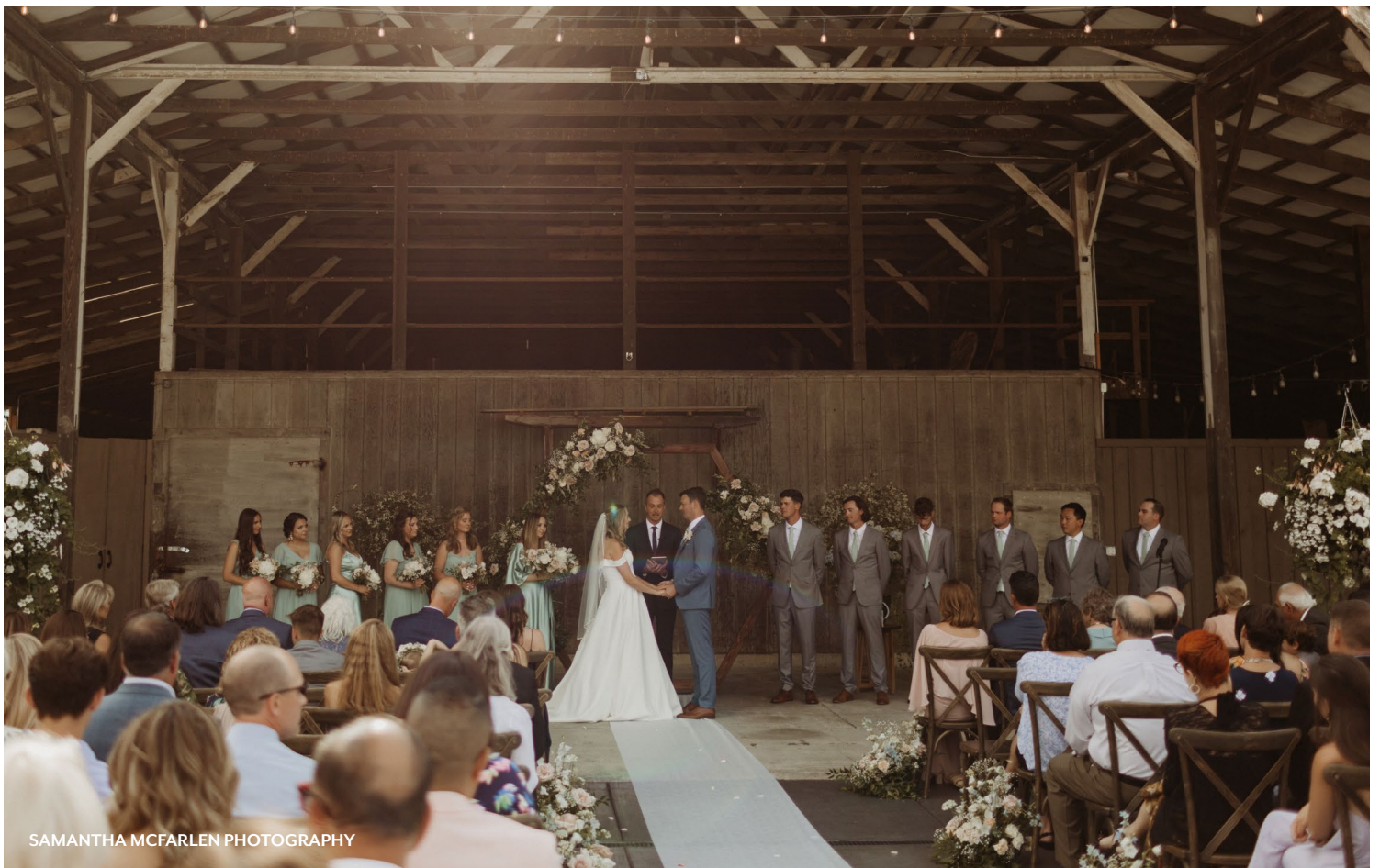
SAMANTHA MCFARLEN PHOTOGRAPHY