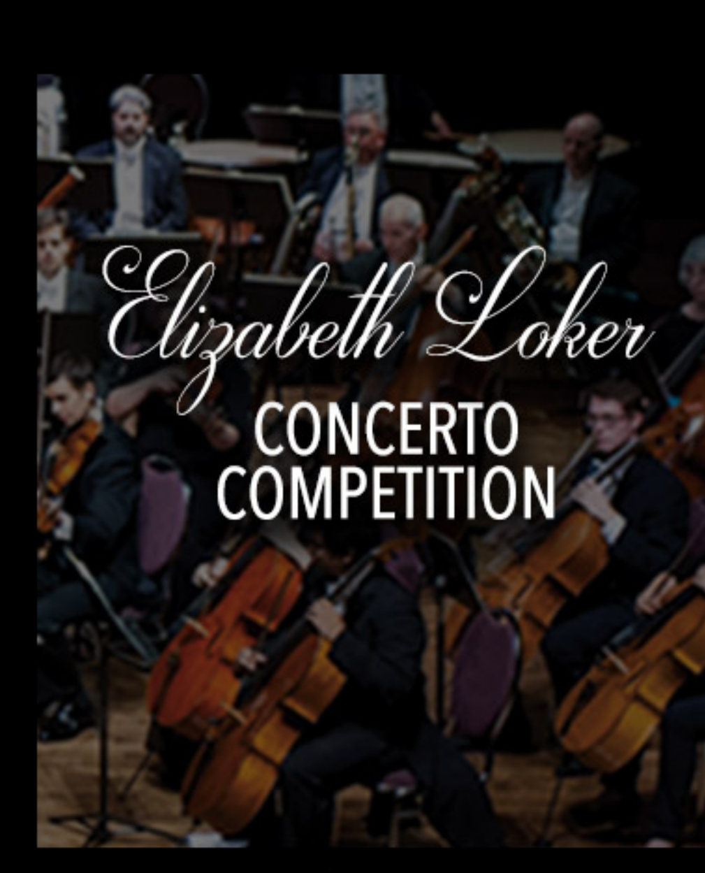
Winner of Competition