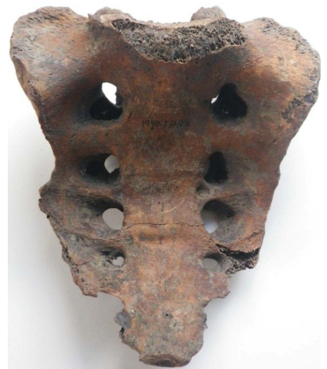
Plate 2 Sk 14071 cranial border shift

Skeleton 3381 (young middle adult female) had an additional lumbar vertebra in her spine. The supernumerary vertebra was located at the lumbar-thoracic border and had lumbar facets and a general lumbar appearance, the right lamina had a small rib facet, and the left lamina was very enlarged and similar in appearance to the fifth lumbar vertebra. It is possible that the vertebral characteristics were the result of a border shift between the sacrum and the coccyx; unfortunately, the coccyx did not survive and was therefore unavailable for examination.