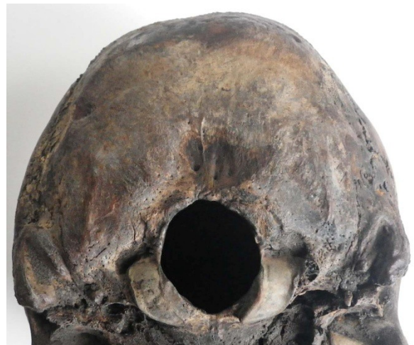
Plate 1 Sk 3381 asymmetry of the occipital

The bones in the cranial vault meet at joints named sutures. Failure of a suture to develop is known as sutural agenesis, whereas premature fusion of a suture is known as craniosynostosis (Barnes 1994). Since the presence of sutures allows the cranium to expand in size during childhood to accommodate the growing brain, if a suture is absent or fuses too early it can prevent the cranium from growing in a certain direction. If other sutures are present and open then the brain and cranium will grow in that direction instead, and the end result will be a deformed cranium.