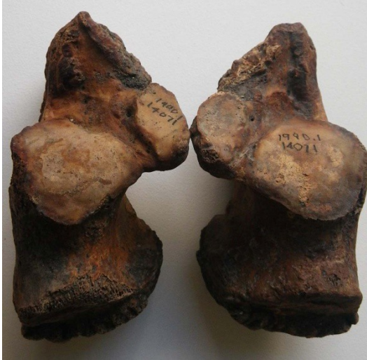
Plate 7 Sk 14071 bilateral calcaneal lesions

Skeleton 14071, a mature adult male, had bilateral crescent shaped lytic lesions on the anterior-medial margin of both calcanei (Plate 7); the surface of the lesions had a roughened appearance. These lesions may be the result of avulsion fractures, usually caused through twisting the ankle in such a way that the bifurcate ligament is strained and the portion of the calcaneus to which it is anchored becomes detached (Daftary et al 2005, Robbins et al 1999). These fractures are difficult to detect in modern patients and as a result the detached portions usually fail to fuse (Daftary et al 2005). They are usually seen in males ( ibid , Robbins et al 1999), however, there is a possibility these lesions are developmental, and further research is required. The same individual was also missing the medial extensions to their