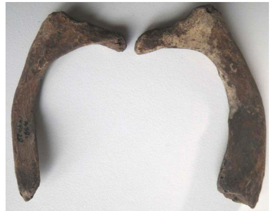
Plate 5 Sk 3381 asymmetry of the first ribs

The young middle adult female (Skeleton 3381) exhibited asymmetry of the first ribs, both of which were very small. The right rib looked to be in proportion, whereas the left rib shaft was half the width of the right, however, it still articulated correctly and had a normal degree of curvature (Plate 5). Irregular segmentation of the sclerotomic tissue during embryonic development can manifest in a variety of ways including bifurcation, flaring, abnormal wideness, merging (fusion), bridging and partial bridging (Barnes 1994, 71).