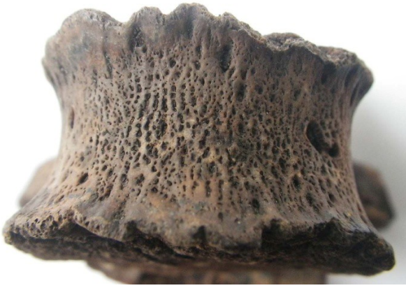
Plate 9 Sk 7016 billowed appearance of superior and inferior vertebral body

skeletal involvement as a result of them is even rarer (Ortner 2003). When skeletal manifestations do occur, they tend to be destructive in origin rather than proliferative. One possible aetiology may be actinomycosis, which is a rare bacterial infection that affects humans and cattle. It is most common in individuals between the ages of fifteen and 35 years (Aufderheide and Rodríguez-Martín 1998, 194). The bacterium is usually focused in the cervico-facial region, where lesions within the oral cavity may give rise to the necessary conditions for the bacterium to thrive. More rarely, it affects the gastrointestinal tract where it may manifest in the thoracic and lumbar regions of the spine ( ibid , 194). Infection is usually