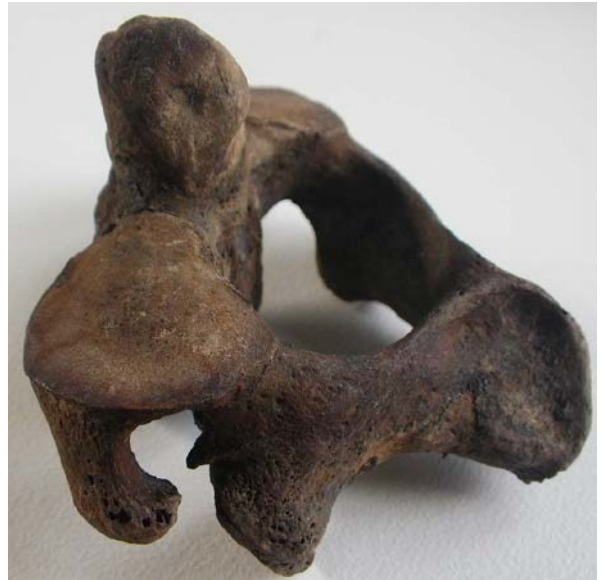
Plate 4 Sk 3381 incomplete transverse foramen

The young middle adult female (Skeleton 3381) had an incomplete left transverse foramen on her second cervical vertebra (Plate 4). Only a small spicule of bone was evident on the posterior-superior margin of the inferior articular facet, which did not meet with the posterior aspect of the transverse foramen, and may have been the result of the dominance of the vertebral artery on that side.