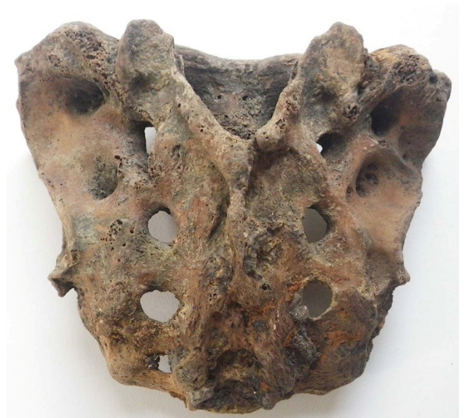
Plate 3 SK 14071 bifid spinous process to first sacral vertebra

A bifid spinous process (part of the vertebra that protrudes posteriorly) was observed in two of the mature adult males (Skeleton 14071 and 15042). In both cases the spinous process of the first sacral vertebra had become bifurcated (Plate 3). Barnes (1994) states that various forms of neural arch clefting are common, especially at border regions (e.g. interface between thoracic and lumbar). In the case of the mature adult male from St Benet's, the observed changes in the spinous process are probably related to a discrepancy in the timing of the development between both halves of the neural arch.