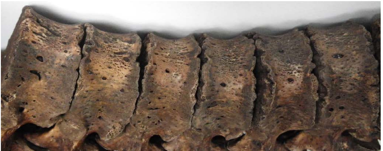
Plate 10 Sk 7016 new bone formation on the anterior surface of the vertebral bodies

The third to eleventh thoracic vertebrae and second to fifth lumbar vertebrae had a billowed appearance around the margins of the inferior and superior bodies (Plate 9). Both of these features are part of normal development, but in this individual appeared to be beyond what is termed normal variation. The anterior bodies of the third thoracic to fifth lumbar vertebrae exhibited a thickened layer of bone along the central region, with remodelled porotic/vascular lesions within the new bone (Plate 10). It is possible that the lesions were the result of a fungal or respiratory infection. Fungal infections are rare and