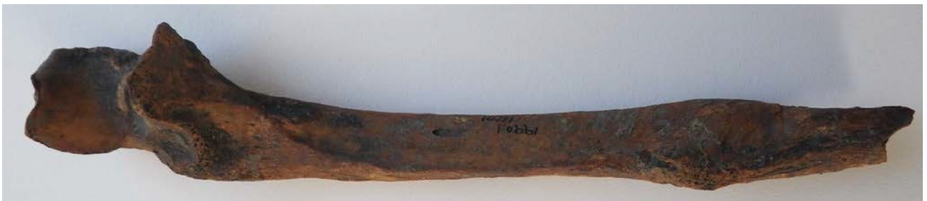
Plate 6 Sk14071 fracture to the distal shaft of the left ulna

Two of the mature adult males had ante-mortem long bone fractures. In Skeleton 14071 the fracture was located on the distal shaft of his left ulna and appears to have been oblique, but the two fragments appear to have reunited well with good apposition (Plate 6). The callous was generally smooth and well remodelled on its anterior, lateral and posterior surfaces, while bone formation along the interosseous border was more irregular and rugged in appearance. According to Dandy and Edwards (2003, 204), '...the ulna is vulnerable to direct trauma and is easily cracked by a direct blow when protecting the face from an impact or from missiles.' A crude prevalence rate of 1.3% of individuals from the early medieval period had fractured ulnae, which was calculated using figures from Roberts and Cox (2003, Table 4.27, 205)