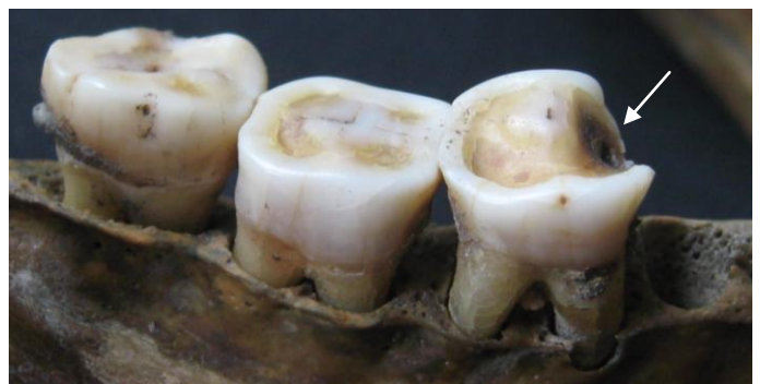
Plate 10 Caries in right mandible of Sk 15548

Dental caries (Plate 10) were only observed in the mature adult female (Skeleton 15548), which was not unexpected since the number of cavities usually increases with age. She had caries in one of her sixteen teeth (6.25%). The prevalence rate of caries at Coppergate was 3.2% and thus lower compared with the frequency of teeth affected by dental caries in the early medieval period, which was 4.2% (Roberts and Cox 2003).