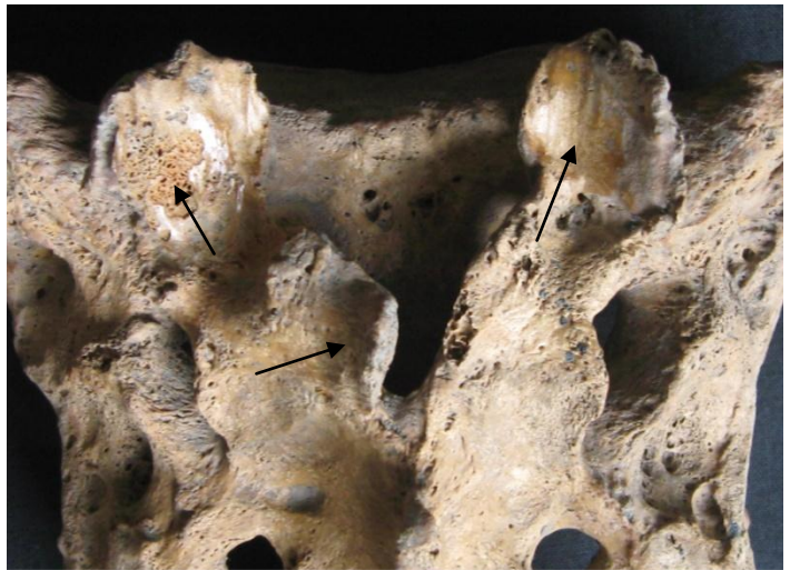
Plate 4 Cleft neural arch (arrow) in sacrum of Sk30944 and osteoarthritis in articular facets (arrows)

A complete and well preserved spine is required to determine whether any variation in the expected number of vertebrae in each vertebral group is the result of a genuine extra vertebral segment (i.e. an additional vertebra) or due to a border shift, and if the latter, what kind of shift has taken place. Unfortunately, the spine of Skeleton 15548 was incomplete and as a result it was not possible to identify whether vertebrae were missing post-mortem or were congenitally absent. Skeleton 15548 possibly had only eleven, instead of the usual twelve thoracic (central) vertebrae. It is, however, possible that one of these vertebrae was lost post-mortem. The superior right articular facets protruded superiorly beyond the left side in the sacrum and the twelfth thoracic vertebra, while the inferior left articular facets protruded inferiorly by 3mm compared with the right side in the third, fourth and fifth lumbar vertebrae. The articular facets on the right side of the ninth, tenth and eleventh thoracic vertebrae were larger than those on the left. The transverse processes of the third, fourth and fifth lumbar vertebrae were twisted and the right sides were smaller than the left. The spinous process of the fourth cervical vertebra was also slightly twisted.