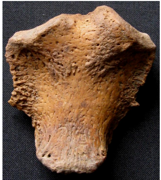
Plate 6 Distorted manubrium of Sk 30944

Cribra orbitalia manifests as fine pitting in the orbital roof. It develops during childhood, and often recedes during adolescence and early adulthood. Until recently, it was thought that iron deficiency anaemia was a likely cause of the lesions (Stuart-Macadam 1992), but a recent study by Walker et al. (2009) has demonstrated that other types of anaemia, including megaloblastic anaemia and haemolytic anaemia, must be considered