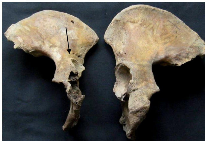
Plate 1 Right hip affected by hip dysplasia and healthy left hip (arrow points to new acetabulum)

The female suffered from considerable secondary complications to the condition. The pseudoarthrosis (newly formed joint) displayed severe eburnation, indicative of osteoarthritis, both at the pelvis (Plate 3) and at the femur. It is clear that the right leg was hardly used, leading to severe atrophy (wasting) of the right whole femur (see Plate 2; including the distal epiphysis), tibia, fibula and also the pelvis. The left leg, on the other hand, seemed much more robust than normal (see Plate