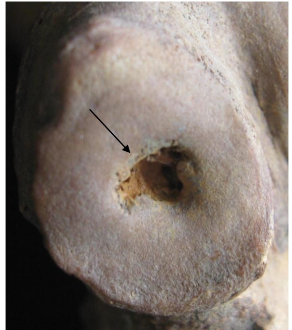
Plate 9 Osteochondritis dissecans lesion in calcaneus of Sk 30944

Skeletons 36318 (young adult female) and 30979 (adult male) had an elongated depression on their left humeri, at the location for the attachment of the pectoralis major muscle. This muscle acts to pull the humerus towards the body (adduction), as well as rotating the humerus inwards (Stone and Stone 1997). Skeletons 15548 and 30944 showed evidence for bone excavations at the right humeri for subscapularis (also on the left humerus of Skeleton 30944) and infraspinatus and Skeleton 15548 also had a bone excavation for supraspinatus . These muscles are part of the rotator cuff and aid in abduction and adduction of the shoulder, lateral and medial rotation of the arm and strengthen the shoulder joint ( ibid ). There was a severe bone excavation for subscapularis on the right humerus of Skeleton 15548, perhaps related to her need for walking aids. The clavicles of Skeleton 30944 had moderate bone excavations for the costoclavicular ligaments. Bone excavations at this site are very common in archaeological populations. There was also an unusual bone excavation at the attachment site for the medial talocalcaneal ligament at the left talus.