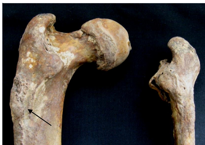
Plate 2 Healthy left femur with muscle trauma (arrow) and right femur with CHD from the posterior