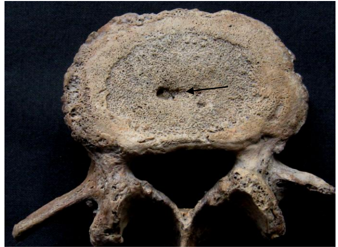
Plate 8 Schmorl's node in Lumbar vertebra of Sk 15548 (also differently sized transverse processes and porosity and slight osteophyte formation at body)

4 th lumbar vertebrae. The old middle adult male (Skeleton 15548) had Schmorl's nodes in the 8 th thoracic vertebra and all lumbar vertebrae (Plate 8). The lesions were mild in the two older adults and mild to moderate in the young adult female. The location of the lesions in the lower part of the thoracic spine and lumbar vertebrae was fairly typical for Schmorl's nodes (Hilton et al. 1976). Roberts and Cox (2003, 195) found that 2.9% of individuals and 16.6% of vertebrae were affected by Schmorl's nodes in the early medieval period, which was much less than the prevalence at Coppergate (35.8%).