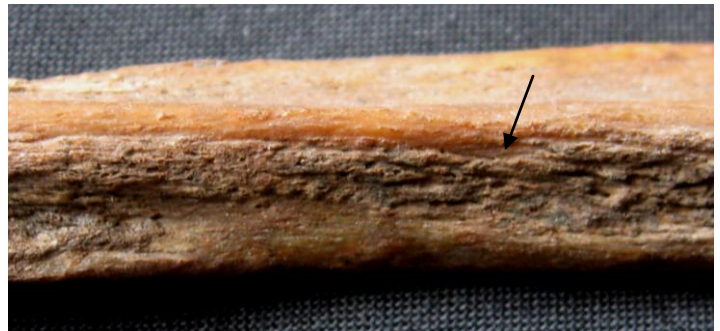
Plate 7 Periosteal reaction at right fibula of Sk 15548

Skeleton 15548 (mature adult female) had distinct striated lamellar bone on the right fibula (Plate 7). She had suffered from a periosteal reaction (inflammatory lesions) of her left lower leg that was healing prior to her death. It is probable that these changes were also secondary to the congenital hip dysplasia and disuse of the right leg.