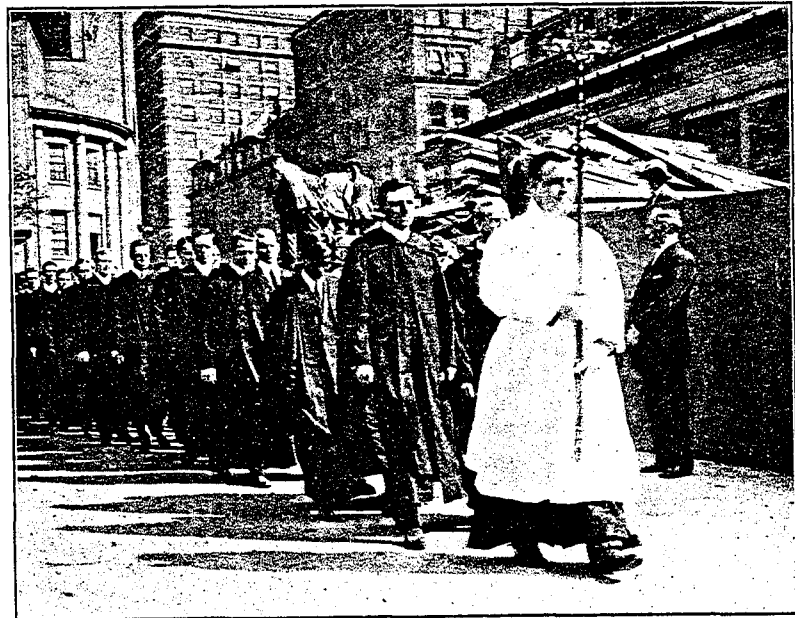
THE THEOLOGICAL STUDENTS LEADING THE PROCESSION TO THE DIOCESAN SERVICE.

The Dean's Message: "This building, rich with memories of consecrated men and women, and dear to us who have worshipped together here as minister and people, enters to-day into the service of the diocese. We pray that it may be-