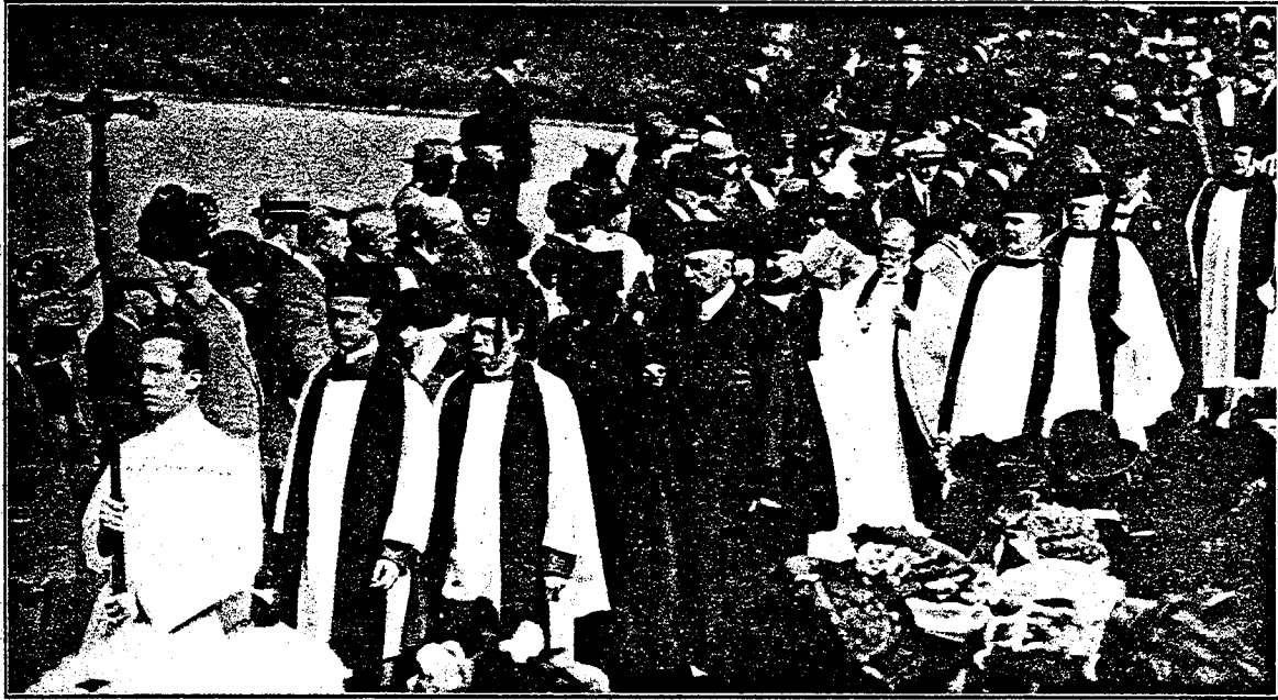
THE CATHEDRAL CLERGY AND CHAPTER IN PROCESSION FOR THE DIOCESAN SERVICE.