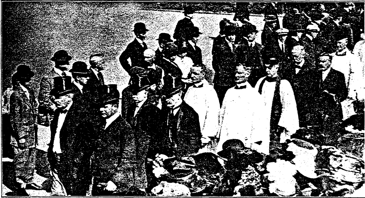
THE WARDENS OF ST. PAUL'S CHURCH AND THE STANDING COMMITTEE OF THE DIOCESE.