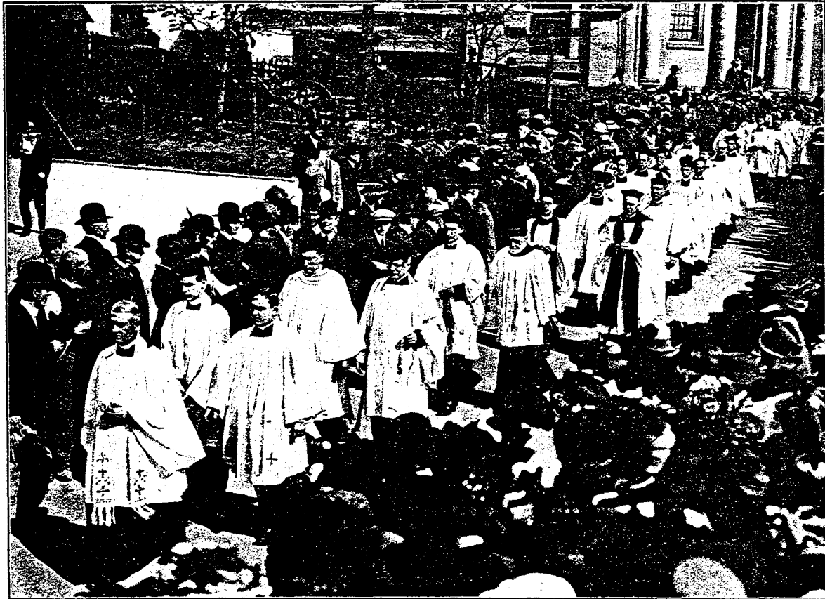
A PORTION OF THE PROCESSION OF CLERGY.