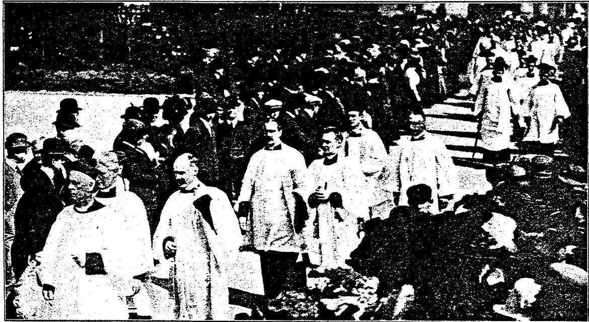
A PORTION OF THE PROCESSION OF CLERGY.