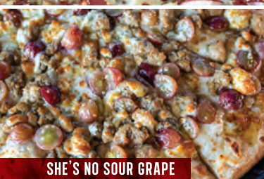
SHE'S NO SOUR GRAPE