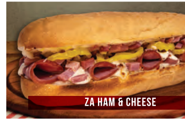
ZA HAM & CHEESE