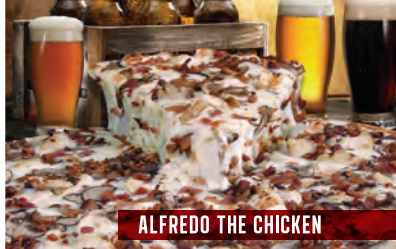
ALFREDO THE CHICKEN

FIRE IN THE HOLE CLASSIC RED SAUCE, MOZZARELLA & MUESTER CHEESE, CHORIZO SAUSAGE, TRI-COLORED JALAPEÑOS, WHITE ONIONS, CHEDDAR CHEESE Traditional: 130/210/240 cal. • Deep-Dish: 230/230/250 cal.