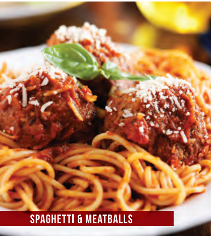
SPAGHETTI & MEATBALLS