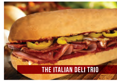
THE ITALIAN DELI TRIO

MOZZARELLA, MUEENSTER, CHEDDAR, PARMESAN AND PROVOLONE CHEESE WITH SLICED TOMATO AND MARINARA SAUCE ON BAKED ITALIAN BREAD LOAF