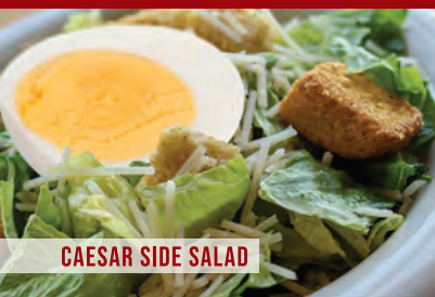
CAESAR SIDE SALAD