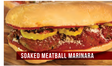
SOAKED MEATBALL MARINARA