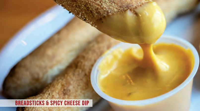
BREADSTICKS & SPICY CHEESE DIP