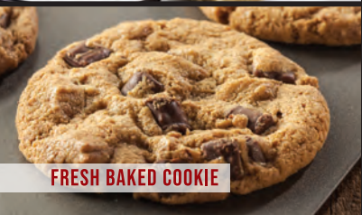
FRESH BAKED COOKIE