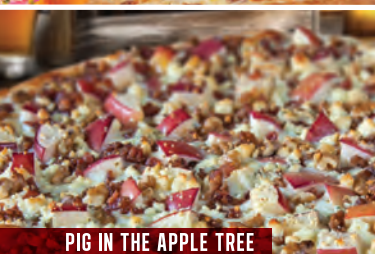
PIG IN THE APPLE TREE