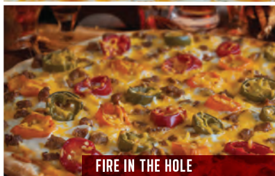
FIRE IN THE HOLE