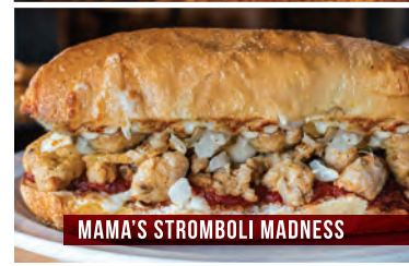
MAMA'S STROMBOLI MADNESS