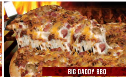
BIG DADDY BBQ