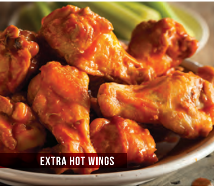
EXTRA HOT WINGS