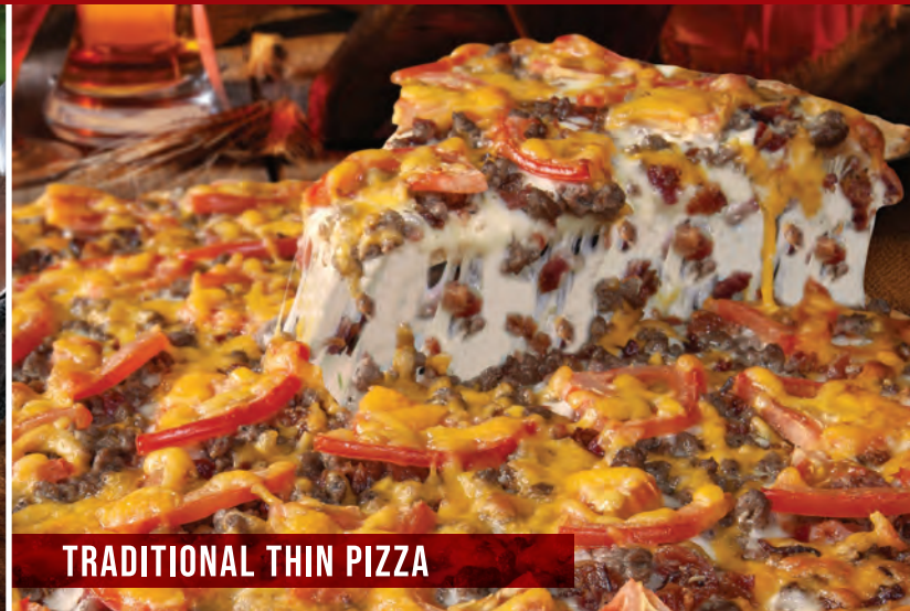
TRADITIONAL THIN PIZZA