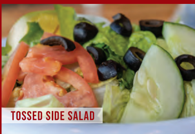
TOSSED SIDE SALAD