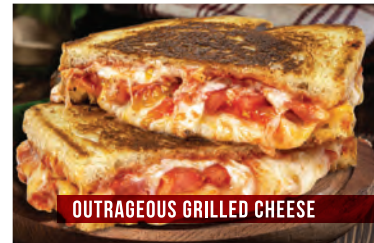
OUTRAGEOUS GRILLED CHEESE