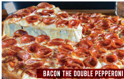
BACON THE DOUBLE PEPPERONI