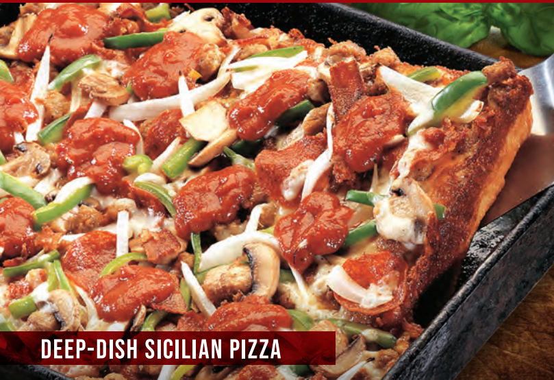
DEEP-DISH SICILIAN PIZZA