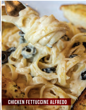
CHICKEN FETTUCCINE ALFREDO

SPAGHETTI & MEATBALLS 700 cal..... 11.99