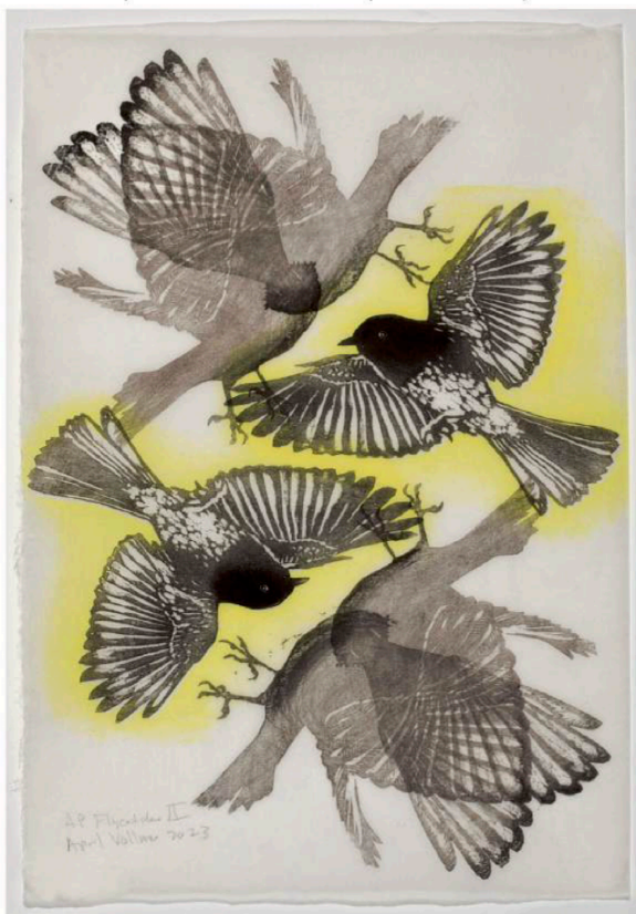
April Vollmer (USA) "Flycatcher II," 2023, 19 x 13 inches, edition 6, on transparent kozo

April Vollmer (USA) created patterns by printing both sides of transparent kozo washi multiple times in "Flycatcher II."