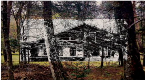
Katsutoshi Yuasa, "This is not a story to be passed on (with blue eyes)," 2023, 36 x 63 inches, image size, edition 3, oil based woodcut on Iwano Heizaburo Kozo paper

metaphysical ideas about the relation of place and time, expressed through his meticulous carving of wood blocks using traditional Japanese tools and materials.