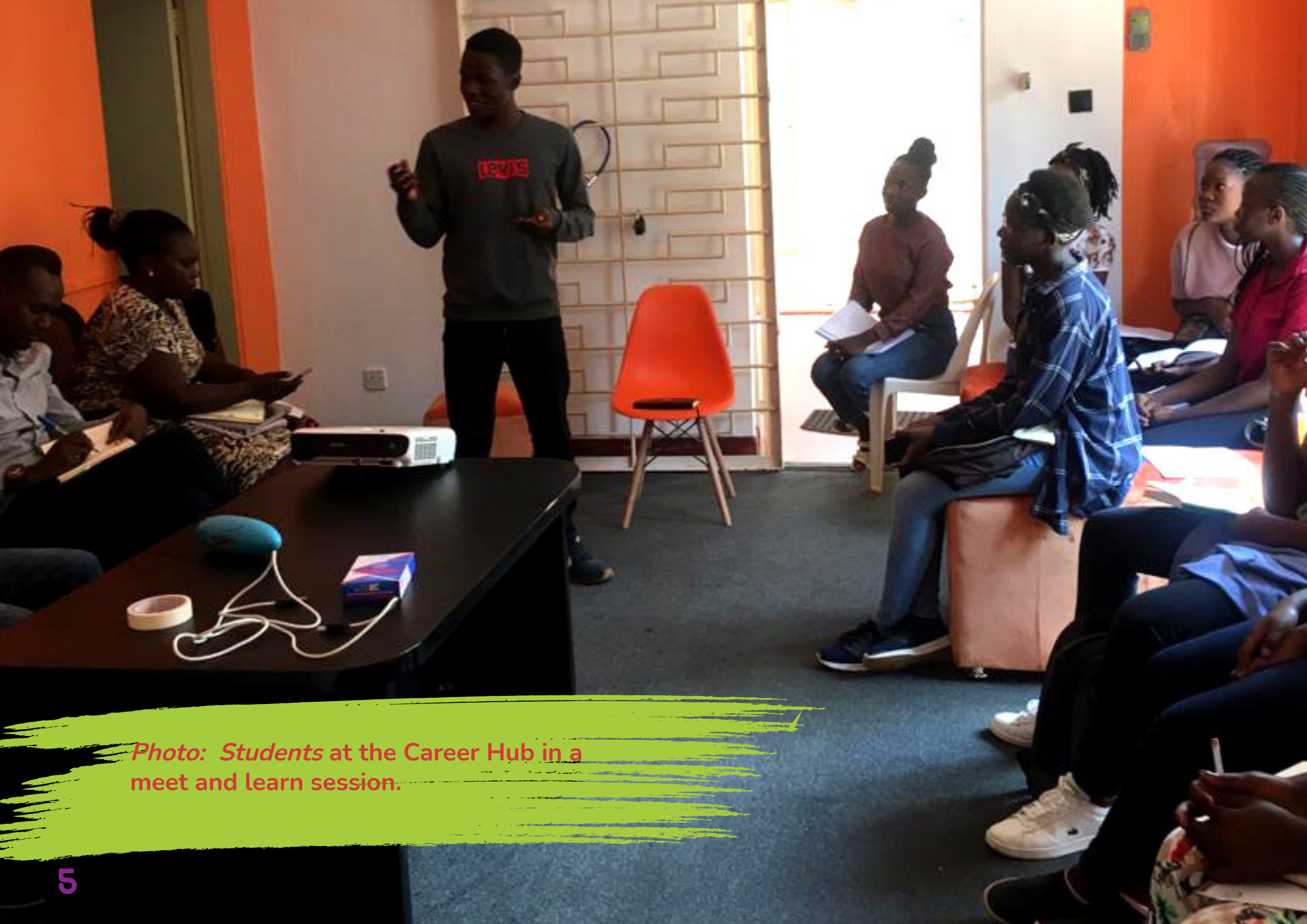
Photo: Students at the Career Hub in a meet and learn session.