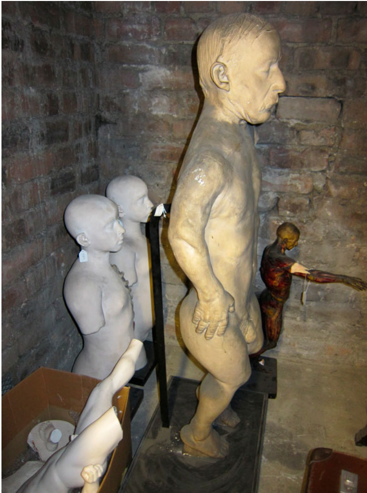
Figure 7. Basement, Edinburgh Anatomical Museum Stores.

Richardson: With nothing catalogued and no proper documentation, how did you set about finding this lost plaster cast?