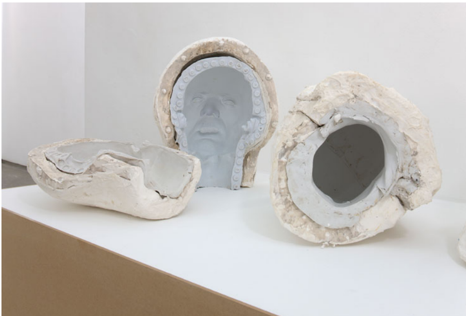
Figure 4. Christine Borland, SimBodies & NoBodies , 2009, Detail Plaster & Silicon Moulds.