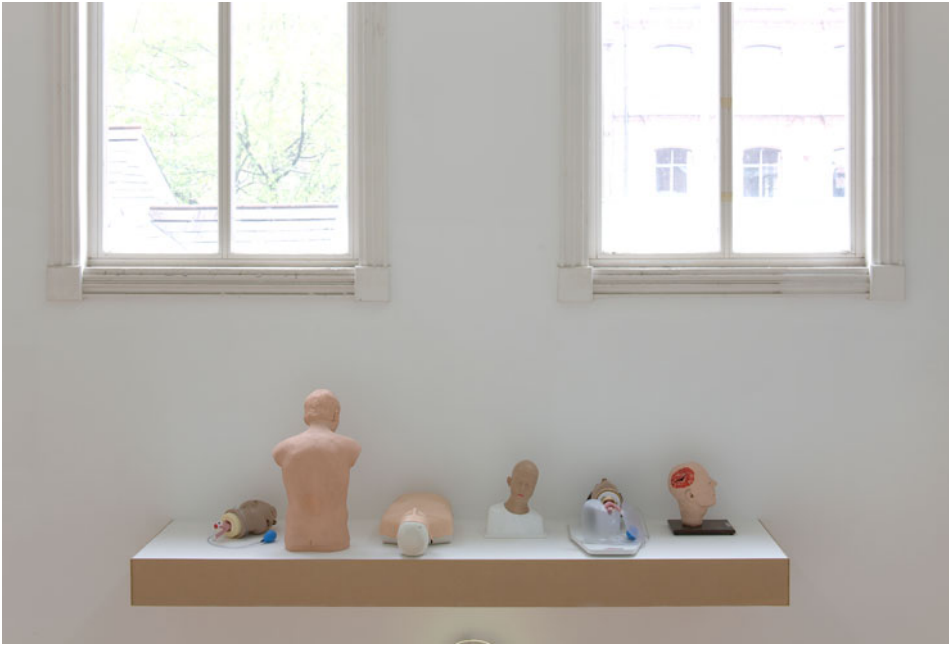
Figure 3. Christine Borland, SimBodies & Nobodies , 2009, Detail, Medical Manikins.