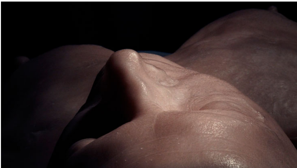
Figure 8. Christine Borland, SimWoman , 2010, Film Still, 12minute 30 second loop, H.D. Video, projected.

B: I feel a certain relief as well and it's been built into the decision-making that I'm not actually physically representing the spectacle of the sculpture as part of the show, in its raw, broken and undignified form – there's plenty of that conveyed in this mediated