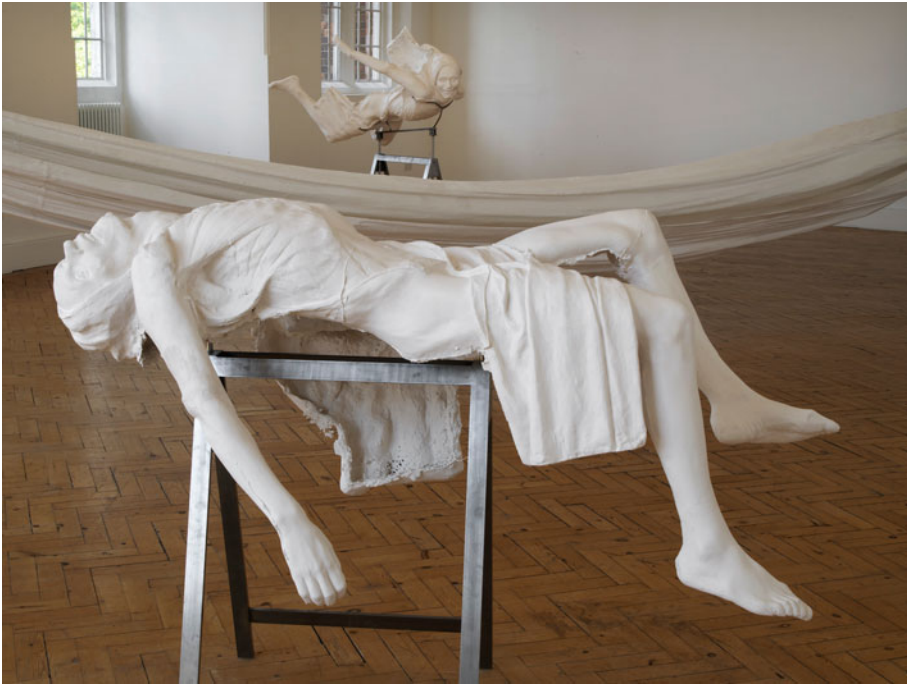
Figure 6. Christine Borland, Cast From Nature , 2011, Camden Arts Centre.

looked to the heavens but stared ahead with a languid but superior menace. Two figures, one classically reposed after death in contrast with the other, caught in the fast race towards death set in a room with an almost imperceptible even settling of fine chalk dust. Plaster is heavier than other dust motes.