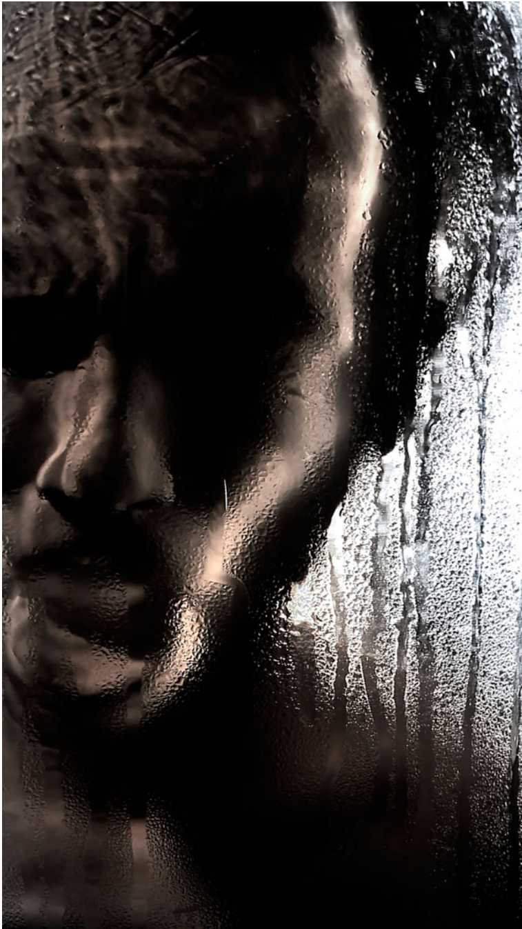
Figure 9. Christine Borland, NoBodies , (Detail) Choking Charlie , 2009, Film Still, 10 minute loop, monitor.