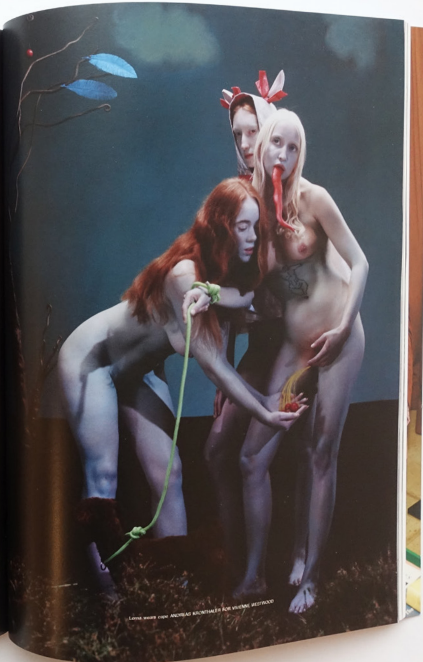
LAVIA WOOD CASE ANDREAS KRONTHALER FOR SIVIGNE MESTIVAL