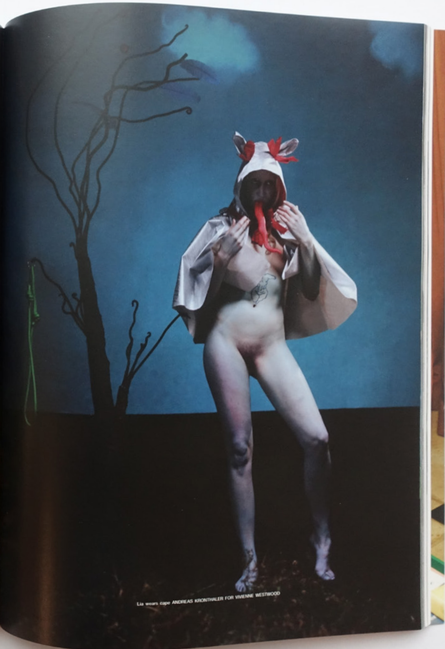
La smara capo ANDREAS KRONTHALER FOR VIVIERE WESTWOOD