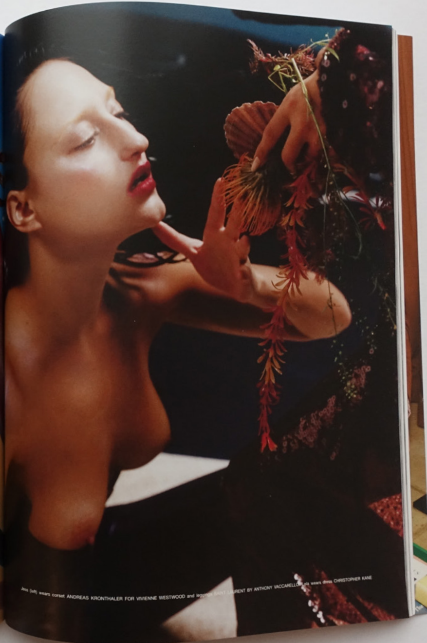
Also (left) wears corset ANDREAS KRONTHALER FOR VIVIENNE WESTWOOD and leggings SAINT LAURENT BY ANTHONY VACCARELLA. She wears dress CHRISTOPHER RANE