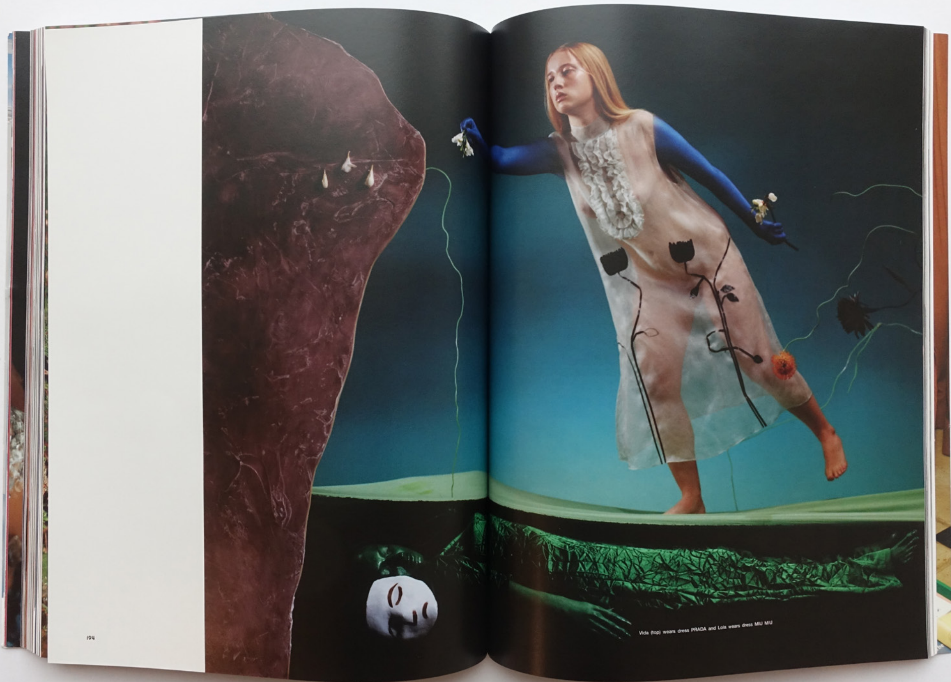
Vida (top) wears dress PRADA and Lois wears dress MIU MIU