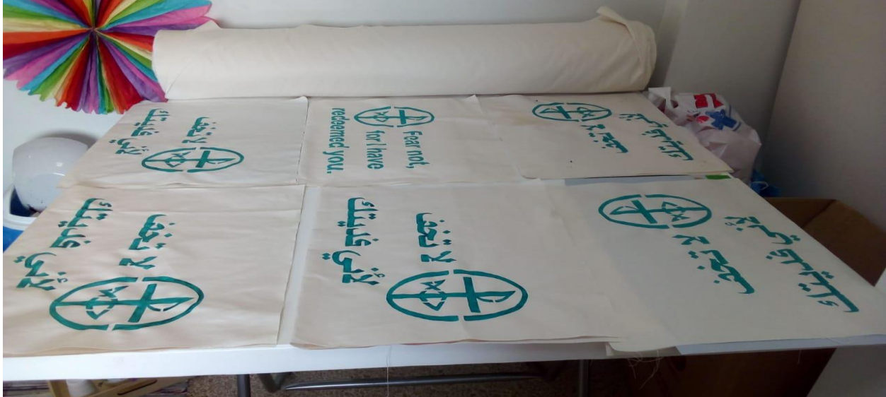
Eco-friendly bags which the participants of the capacity building session, produced, Feb 2020, Photo Credit: Diakonia.