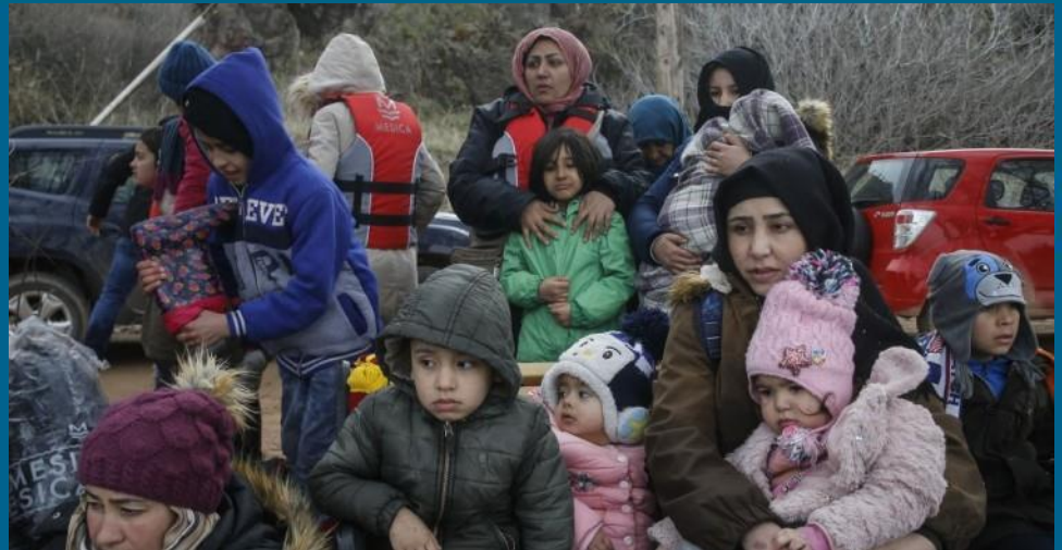
Syrian Forced Migrants in the Idlib Governorate, Feb 28, 2020, photo credit: Middle East Institute