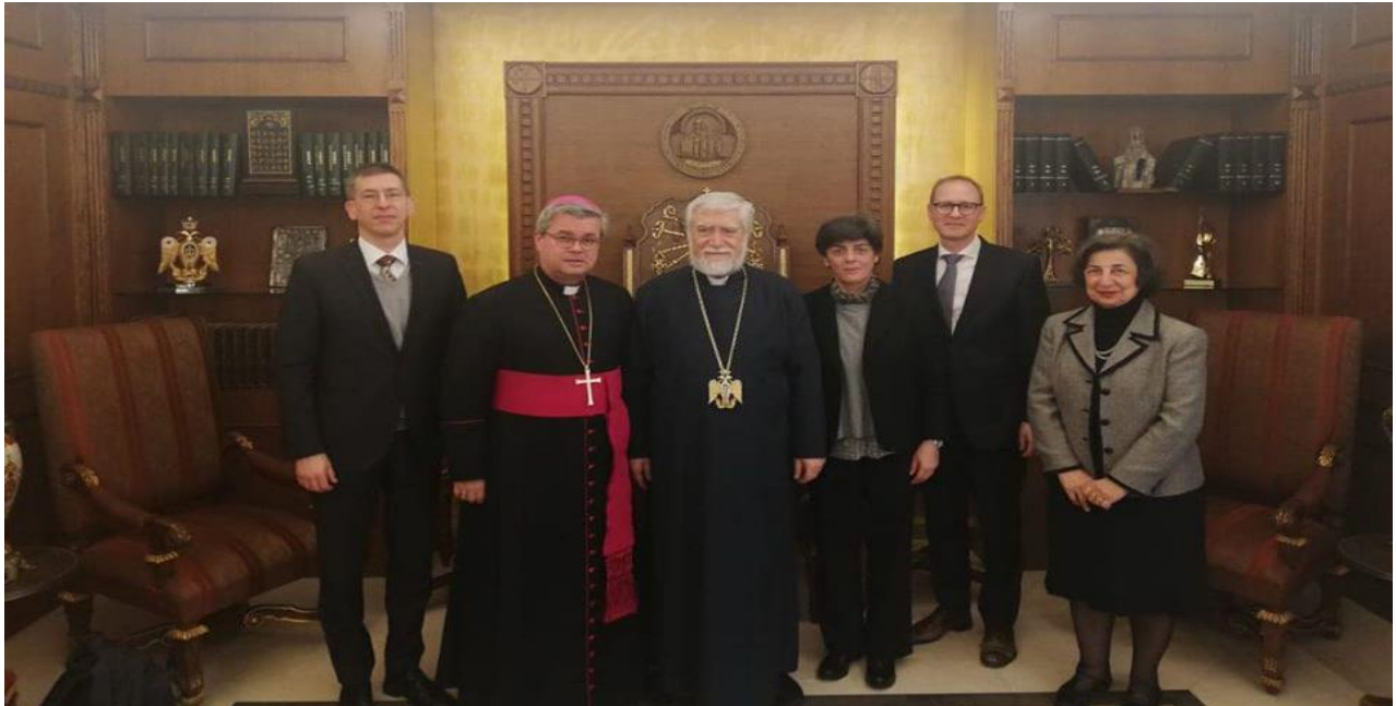
German Catholic Bishop's conference delegation visiting His Holiness Catholicos Aram I, Feb 12-14, 2020