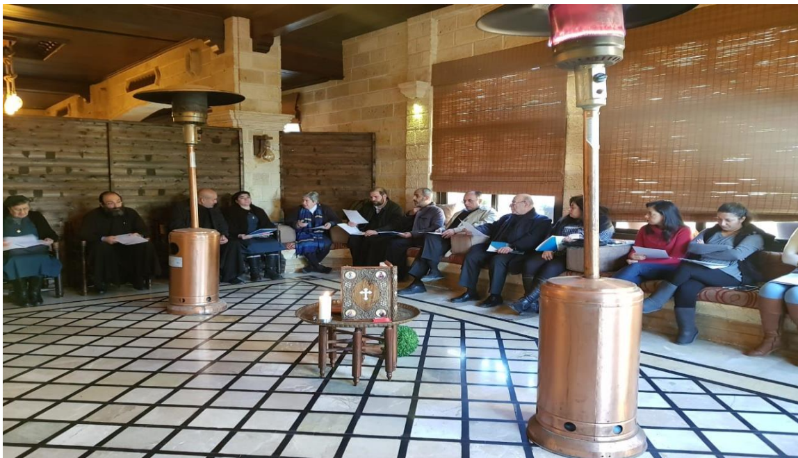
Trauma Healing and Spiritual Counseling held in Syria, Jan 27- Feb 1, 2020, Photo Credit: MECC website.

The MECC Theological and Ecumenical Department (TED) held the first session of its program “Trauma Healing and Spiritual Counseling”, dedicated for ministers and pastors from different parishes in the village of Al-Mishtaya in Wadi Al-Nasara - Syria from January 27 till February 1, 2020.