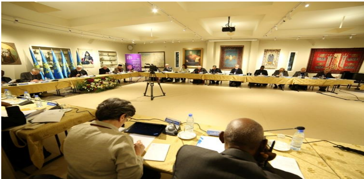
The Armenian Church Catholicosate of Cilicia's Ecumenical Consultation, Feb 6, 2020