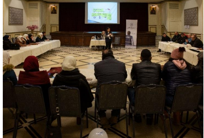
Child Protection course for 43 teachers in Damascus rural, Feb 2020, Photo Credit: Diakonia.