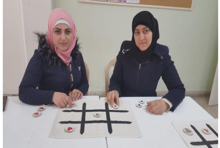
Health Awareness session (L) and MHPSS session (R), Feb 2020, Photo Credit: Diakonia.