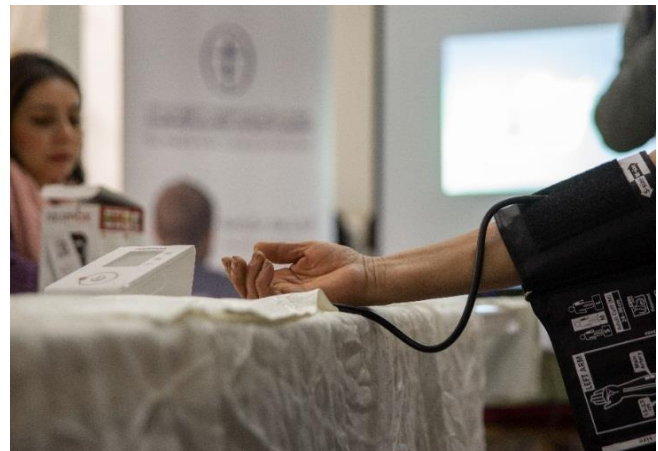
Health Awareness sessions for 20 women in Damascus, Feb 2020, Photo Credit: Diakonia.