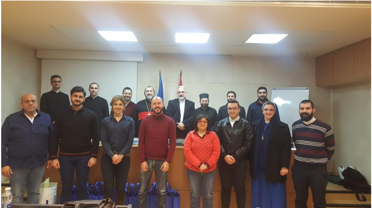
Meeting of Theology Students from Lebanon, Syria and Iraq, Feb 1, 2020