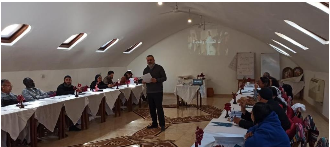
Trauma Healing and Spiritual Counseling in Egypt, Feb 2-8, 2020, Photo Credit: MECC website.