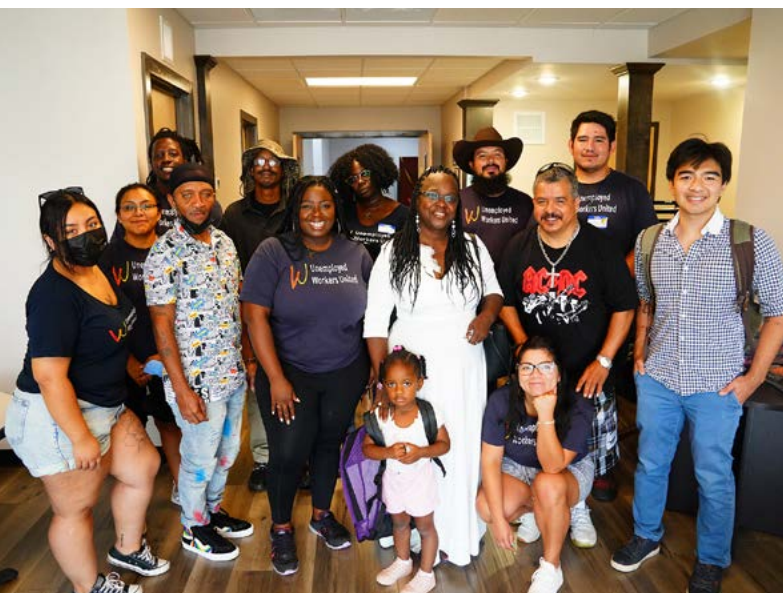
Houston temp workers gathered with organizers with Unemployed Workers United for a committee meeting.

Temporary workers across the country are fighting back against this exploitative business model, demanding that legislators and regulators pay attention to the harms of the temporary work industry. From New Jersey to Illinois, temporary workers have already won historic regulation, including equal pay for equal work to safety and reporting requirements. We must continue to build momentum together, strengthening alliances between unionized workers, direct-hire workers, and temporary workers to challenge the temporary work business model and the impacts it has on our wages, working conditions, and ability to organize. We offer the following recommendations.