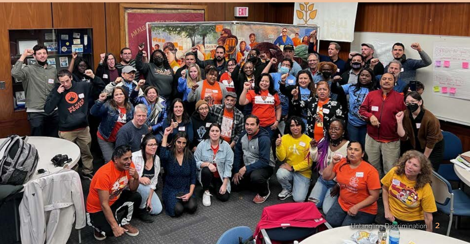
Temp workers and advocates gathered in New Jersey to discuss strategies to organize, build power and fight back against exploitative staffing agencies and the companies that use them.

This report, building on decades of documentation by organizers and researchers, begins by grounding the temporary staffing industry’s business model in a history of racism and gender discrimination. It then presents results from matched-pair testing in Harris County and Nashville to illuminate 21st century racial and gender discrimination in access to employment. The report concludes with recommendations that include concrete ways to improve working conditions for temporary workers and emphasize that all levels of government should stop subsidizing this exploitative business model.