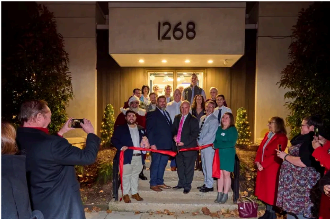
MG Architects cut the ribbon Dec. 4 on their first ever permanent location at 1268 Penn Avenue in Wyomissing. (Courtesy of MG Architects)

That all changed Dec. 4., when the company, for the first time, cut the ribbon on its very own building.