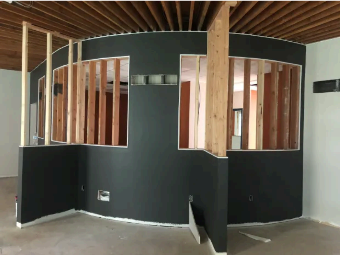
Interior renovations to MG Architects new location were done in collaboration with D&S Elite Construction, Inc., of Amity Township.

Interior renovations have been taking place at the site over the previous six months, Cody said.