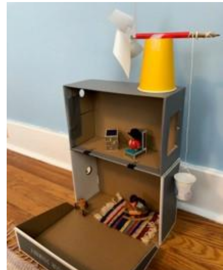
Figure 1. House with wind-powered elevator.

The wind-powered "elevator" uses a rotating pinwheel attached to a pencil to lift a small paper cup. To make the pinwheel (see Figure 2), take a square piece of paper, cut in along the diagonals toward the center (but stopping within about 1 cm from the center), fold one corner of each section into the center, and fasten these corners with tape.