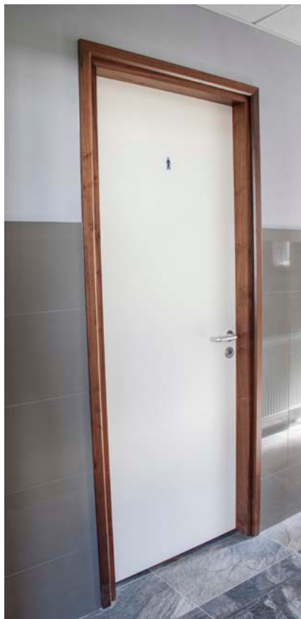
Laminate door set with Walnut frame

We offer specialist bespoke acoustic panelling and acoustic door sets to achieve up to 40dB rating.