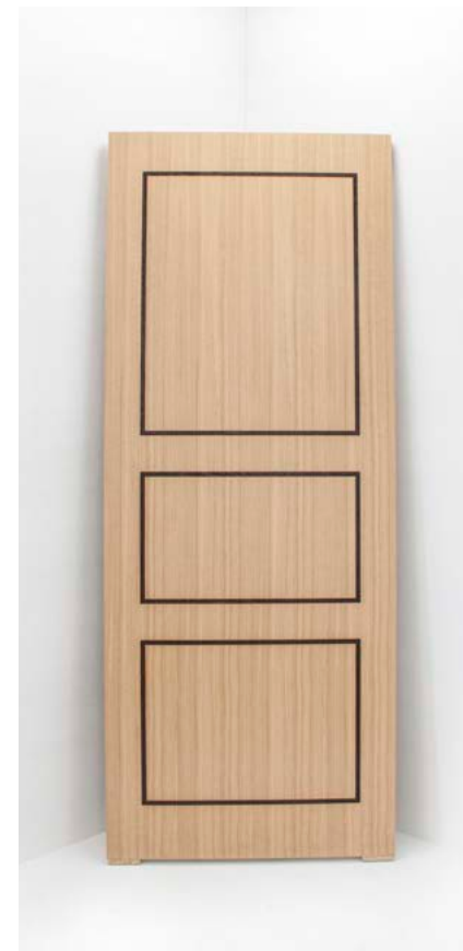
Quarter Cut European Oak door with Wenge inlay