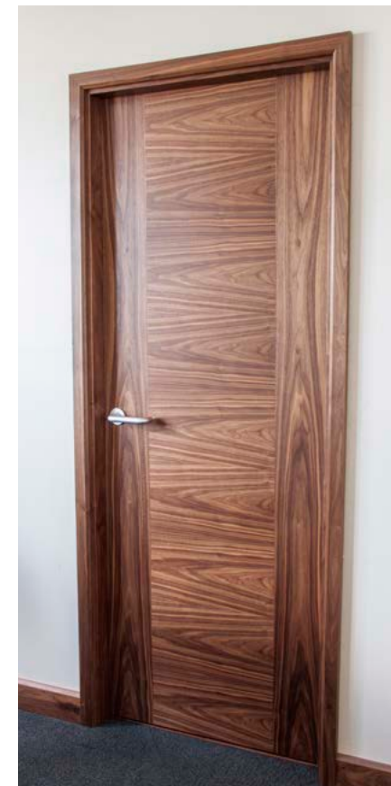
Walnut door set with horizontal veneer