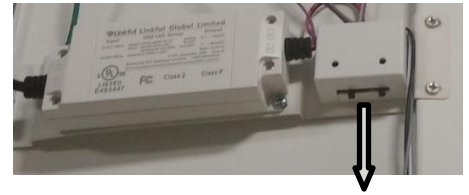
Watt-CCT Changeable Dip-Switch