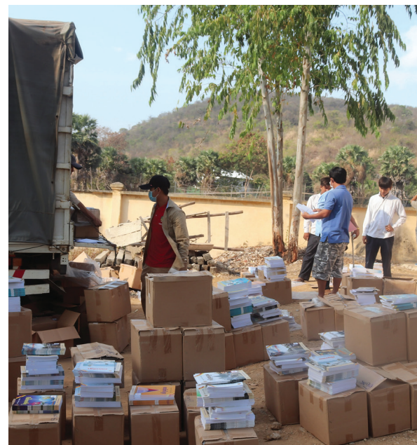
Textbooks being delivered.

for All Children (REACH) Trust Fund has supported projects in these countries that track books along the book supply chain and that include elements of results-based financing (see Box 7).