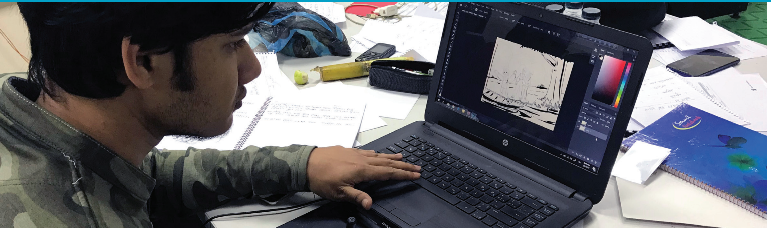
Illustrator at the Marma Onuprerona competition.