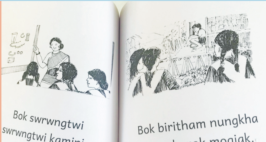
One of the winning Kokborok titles.

Results-based financing incentivized community members to take part and create books in local languages.