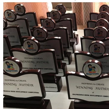
In addition to trophies, winning authors received signed certificates and a cash prize.