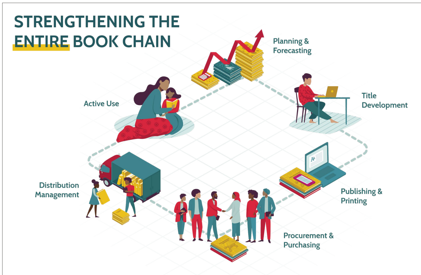
FIGURE 1. THE SIX PHASES OF THE BOOK SUPPLY CHAIN