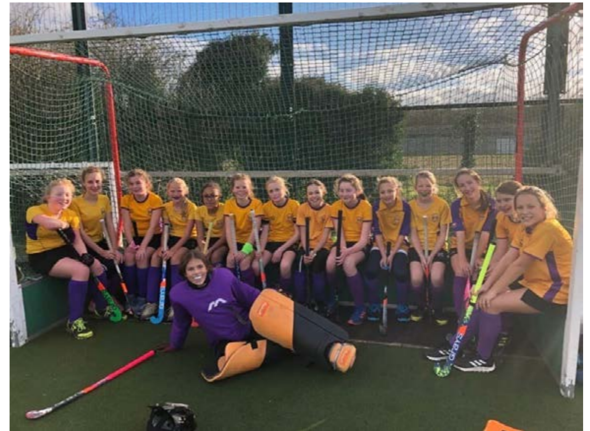
WHC Girls U12 Team