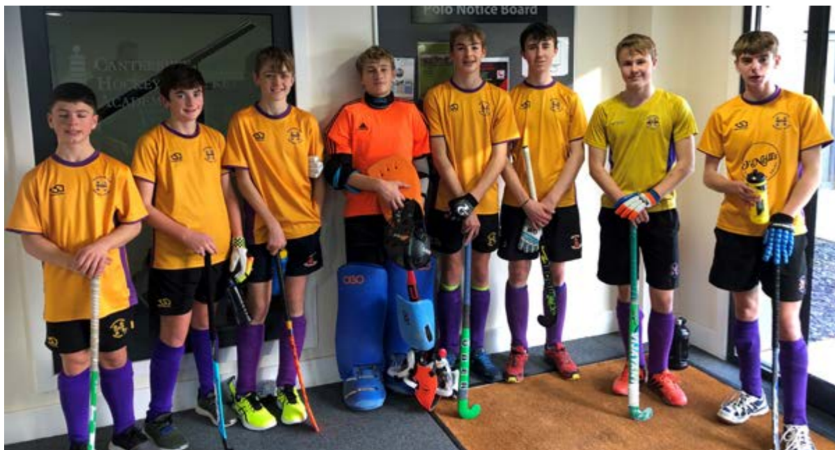
U16 Boys Indoor Team