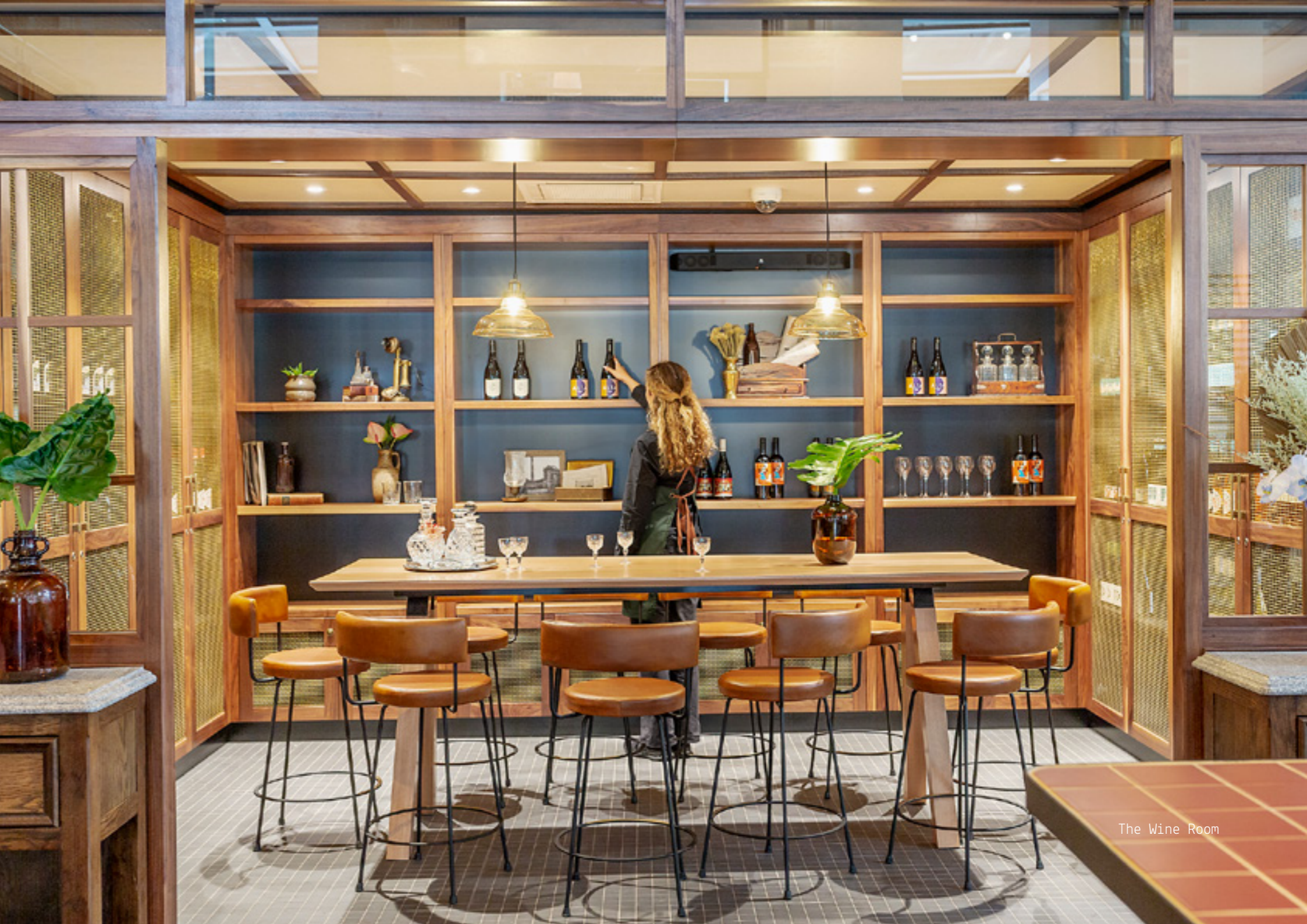
The Wine Room