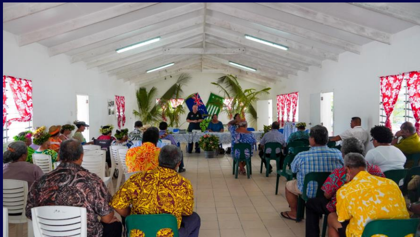
Consultations held in Mitiaro, April 2021

Recent consultations include with the House of Ariki and on Mitiaro. We plan to step up our engagement in the second half of this year, and look forward to talking to our people about the work Government is doing in the SBM sector.