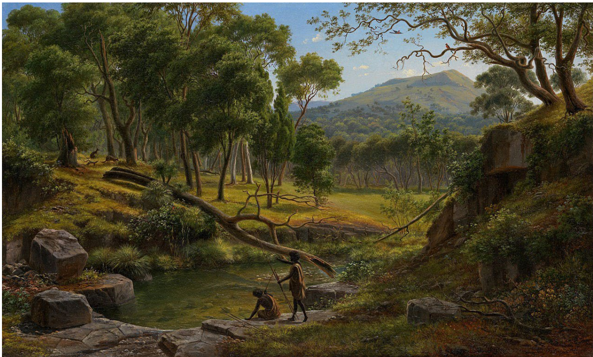
Image: Warrenheip Hills near Ballarat 1854, National Gallery of Victoria, by Eugene von Guérard

Countless events have occurred on Wadawurrung land in Ballarat since European settlement in the 1830s, but the most famous was the 1854 Eureka Rebellion, which occurred nearby. This land has sustained the Wadawurrung people for thousands of years and continues to today. It has provided food to eat, water to drink, medicine for healing and shelter for protection from the cold, heat and rain.