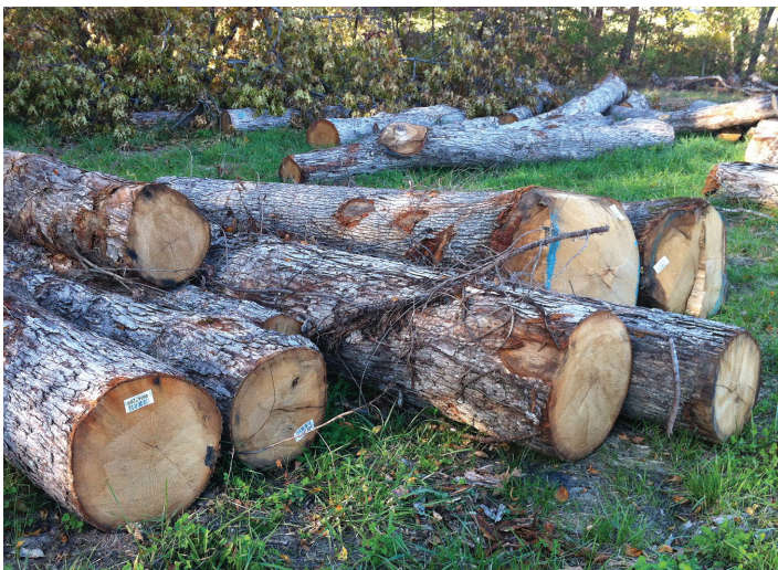
Figure 3: These white oak logs have been laid out on the log yard to be sorted based on quality and hauled to the appropriate markets.

Most oaks are important providers of forest products, and white oak is no exception. White oak provides a wider range of products to the forest product industry than most other oaks. Lower quality white oak, possessing knots or other blemishes, is harvested for a number of lower valued products such as pulpwood for paper production, logs for manufacturing pallets, crossties for railroads, and the sawing of lower quality lumber.