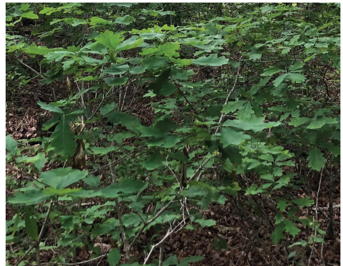
Figure 5: This oak regeneration is approximately 4 feet tall and contains vigorous white oaks capable of outgrowing competition.

White oak is clearly an important component of our forests. Not only is white oak an important timber resource, but it is also one of the most highly valued wildlife trees in the eastern United States. All of these reasons compel us to work towards sustaining this important resource. The use of oak-friendly management practices is a key element in ensuring that white oak forests continue to successfully regenerate and thrive.