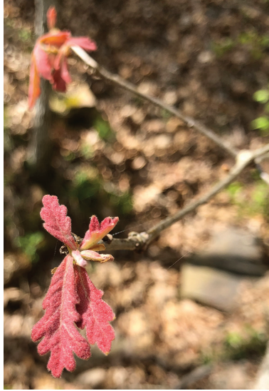
Figure 2: Newly emerging white oak leaves provide browse for deer.

Mature trees develop cavities which can be used by a wide range of wildlife including birds, squirrels, and raccoons. Many birds nest in white oak, such as the near threatened cerulean warbler that spends much of its time hopping around from branch to branch feeding on insects in the canopy of mature white oaks. The cavities and flaky bark of white oaks are also used as hiding places in the summer by a number of forest dwelling bats, some of which are federally protected. Oaks, including white oak, are also home to more species of Lepidoptera (moths and butterflies) than any other tree species, making them an important food destination for many species of wildlife. White oak provides significant food and shelter to many different species of wildlife and is critical to the overall health of the ecosystem.