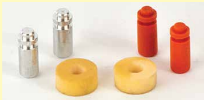
Aluminium Counter Pins Vulcan Rings Product code YVRINGS