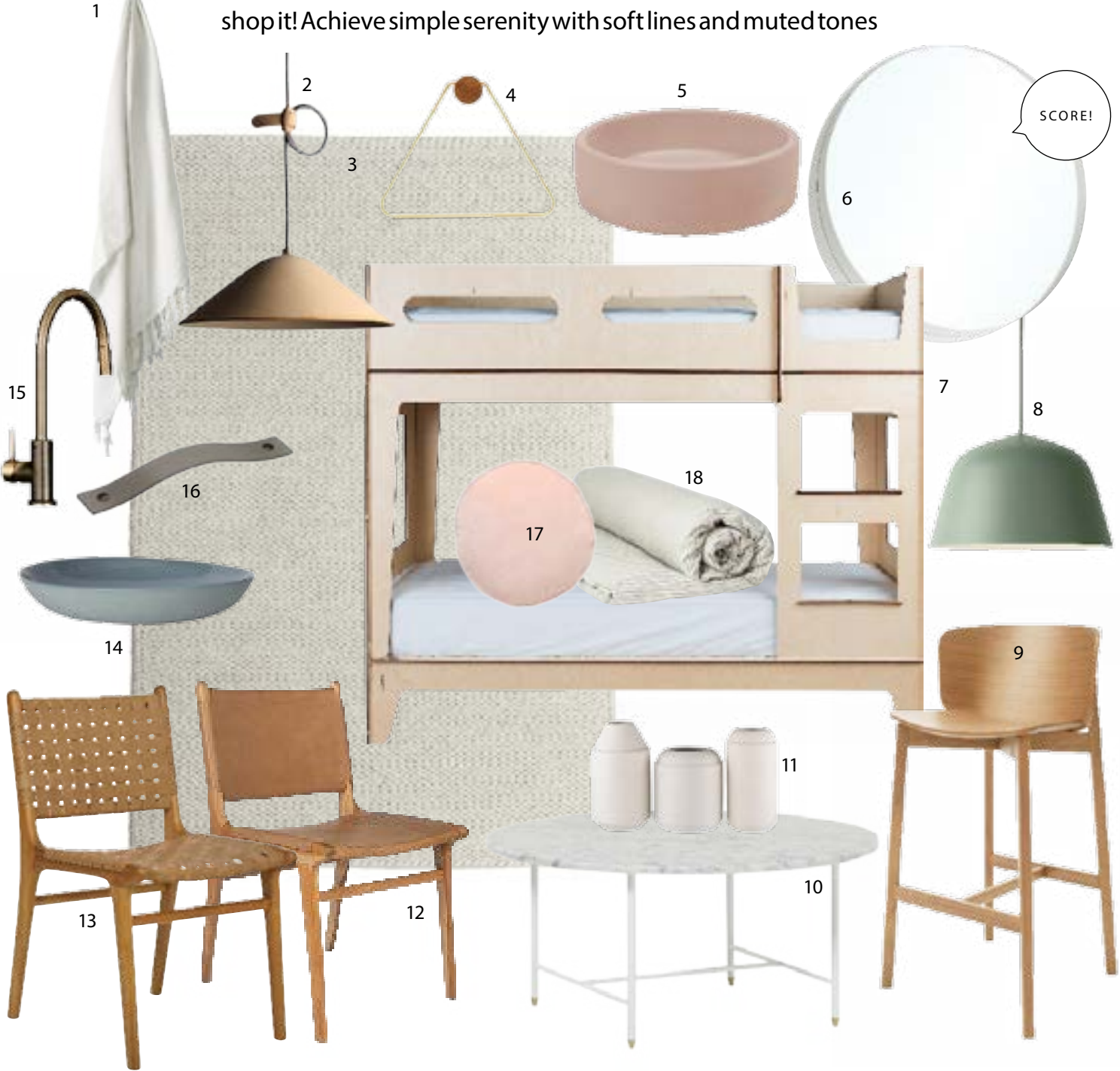
Rest easy Plywood furniture from Plyroom is simple and elegant for the master bedroom. The Dr Spinner pendant light is from Dowel Jones and the bedlinen is from In Bed.

shop it! Achieve simple serenity with soft lines and muted tones