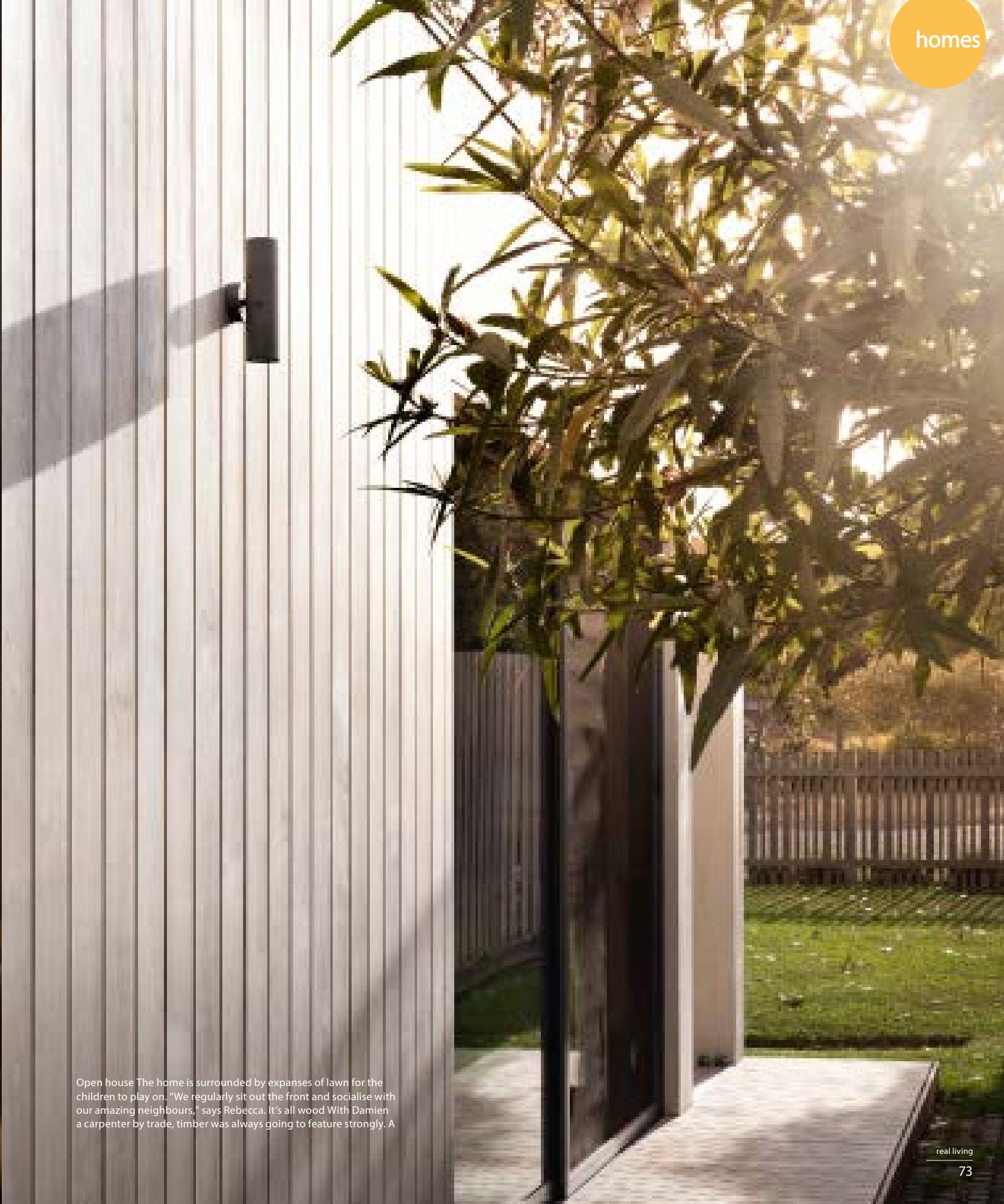
Open house The home is surrounded by expanses of lawn for the children to play on. "We regularly sit out the front and socialise with our amazing neighbours," says Rebecca. It's all wood With Damien a carpenter by trade, timber was always going to feature strongly. A