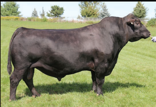
Spring Cove Crossbow