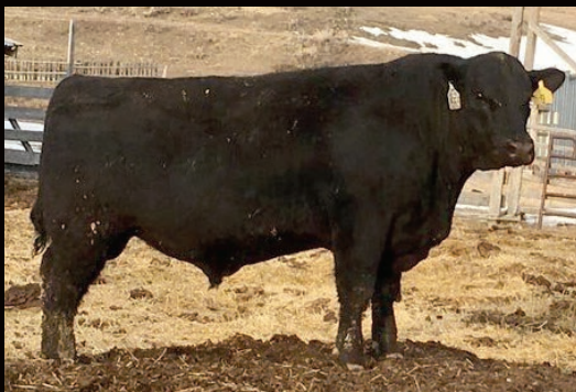
Leachman Resource 8566