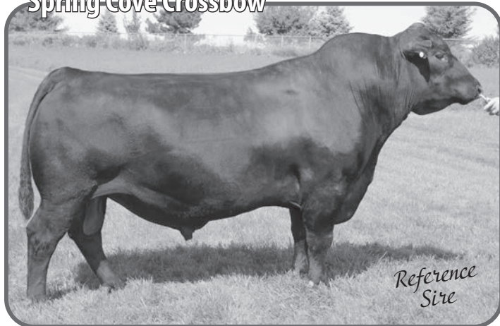
Spring Cove Crossbow