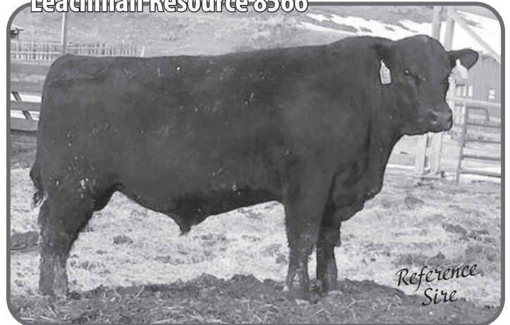
Leachman Resource 8566