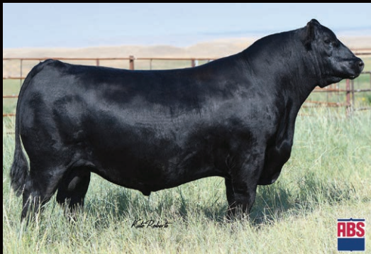
Tehama Patriarch F028