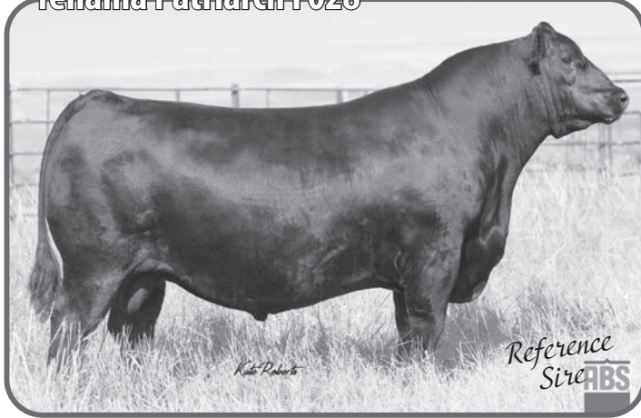
Tehama Patriarch F028