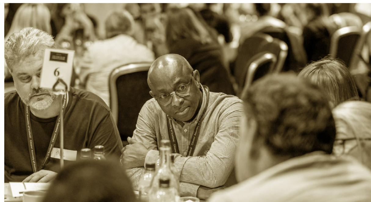
Citizens' Assembly of Scotland - 2019

As an organization, XR NYC advocates that the maximum amount of power and autonomy be granted to the Assembly. However, XR NYC will not be involved in the planning or implementation of the Citizens' Assembly (see FAQ #19).