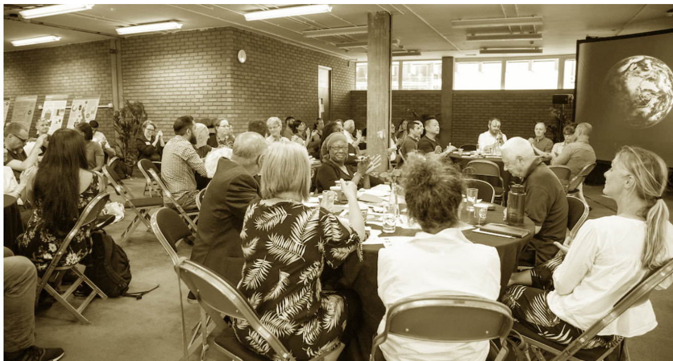
Camden Citizens' Assembly on the Climate Crisis - 2019

Ultimately, the dollar cost must be weighed against the potential benefits. If a CA informs and aids in a comprehensive NYC response to the climate emergency, then it will have mitigated costs in lives, human suffering, and physical and economic damage, all for a tiny fraction of the amount that NYC has already pledged towards climate emergency response.