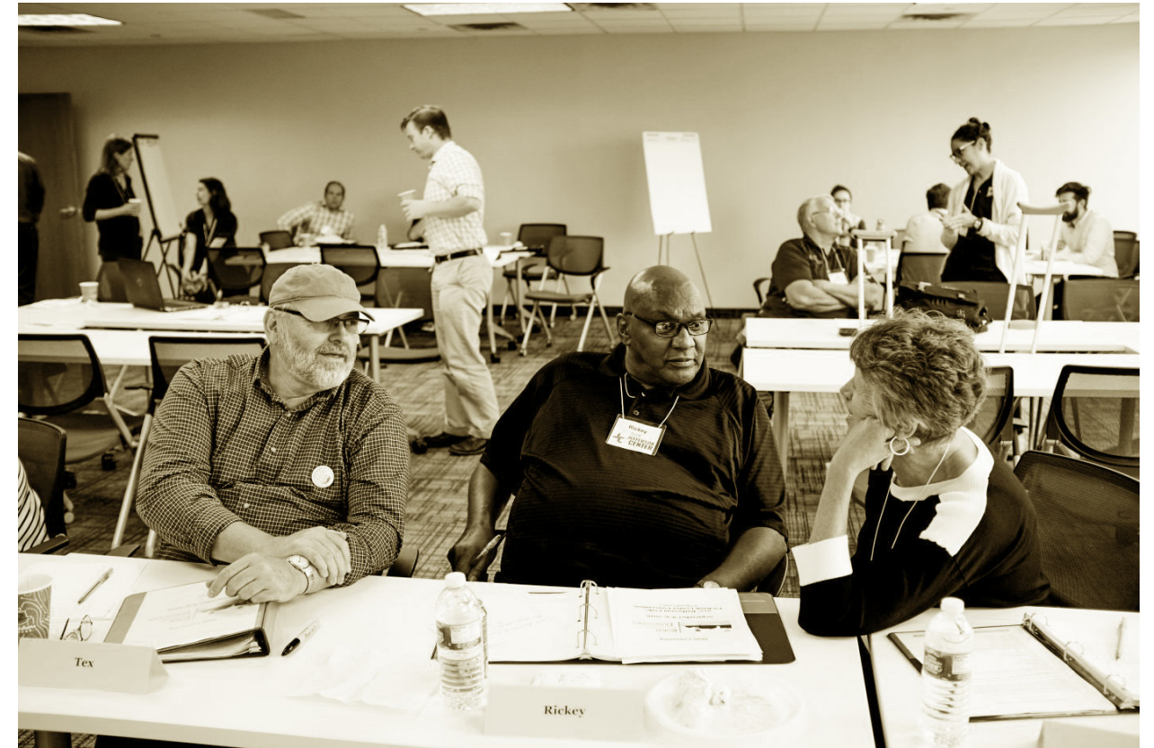
Rural Climate Dialogues State Convening - 2016

“ I have to admit when I came here when people talked about climate [change] I thought ‘oh, come on’ – did I ever learn a lot. I am grateful. ”