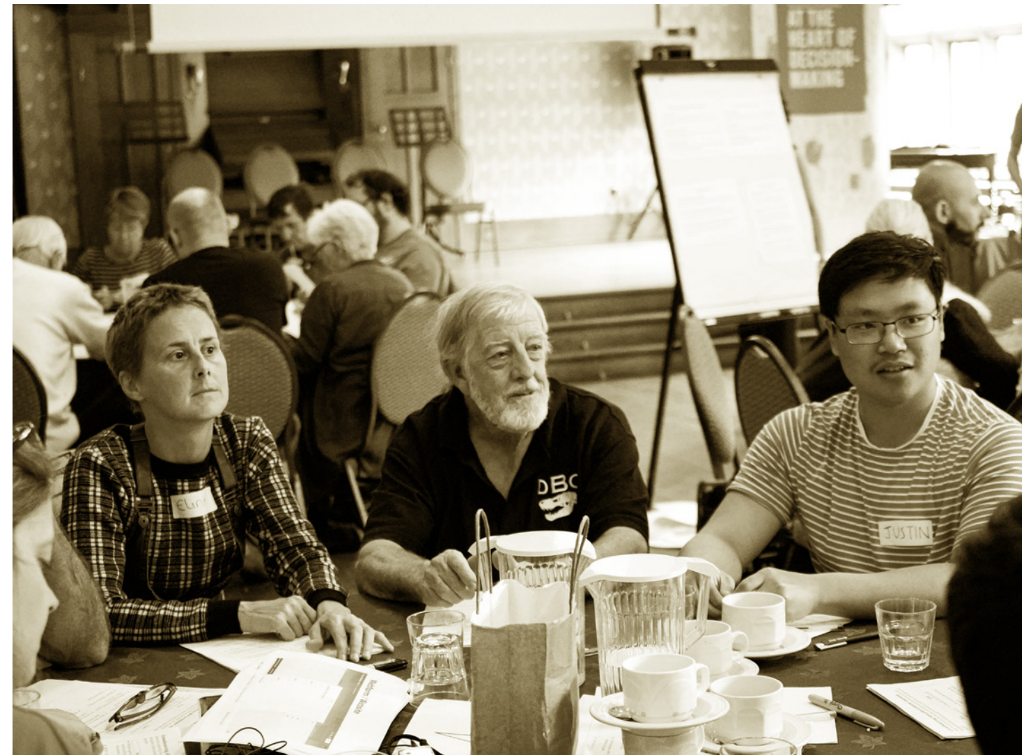
National Assembly for Wales Citizens' Assembly - 2019

A Citizens' Assembly is an important event in the life of a community and citizens should be informed that it is happening and given information about how they can get involved. The Assembly should be widely publicized before it is formed, while it is in session, and when the results of its work are available.