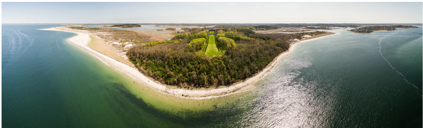
1: The Crane Estate in Ipswich, MA.

Boston & Ipswich, MA – September 16, 2019 – The Trustees of Reservations ( The Trustees ) and Town of Ipswich (Town) are pleased to announce that the Town has been awarded a $163,732 Coastal Resilience grant from the Massachusetts Executive Office of Energy and Environmental Affairs’ Office of Coastal Zone Management (CZM) for the second phase of an innovative climate change adaptation project currently in progress along Argilla Road , a key point of access for over 350,000 visitors to the Crane Estate each year.