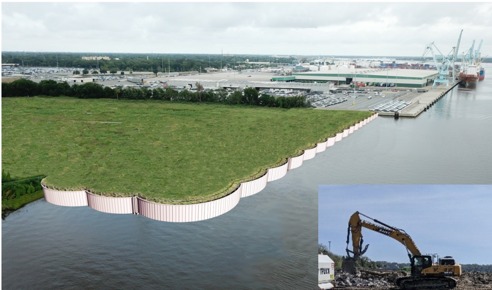
Left. This rendering shows the environmental bulkhead to be installed to contain contaminated and dredged sediment behind the bulkhead's steel wall and to protect St. Johns River receptors.

EPA divided the Site into two operable units – OU1 and OU2 – to facilitate cleanup of known contamination. Site-related contamination of sediment and surface water in Deer Creek (OU2) will be addressed by an OU2 Remedial Investigation expected to be initiated in early 2023 and to continue into early 2024.