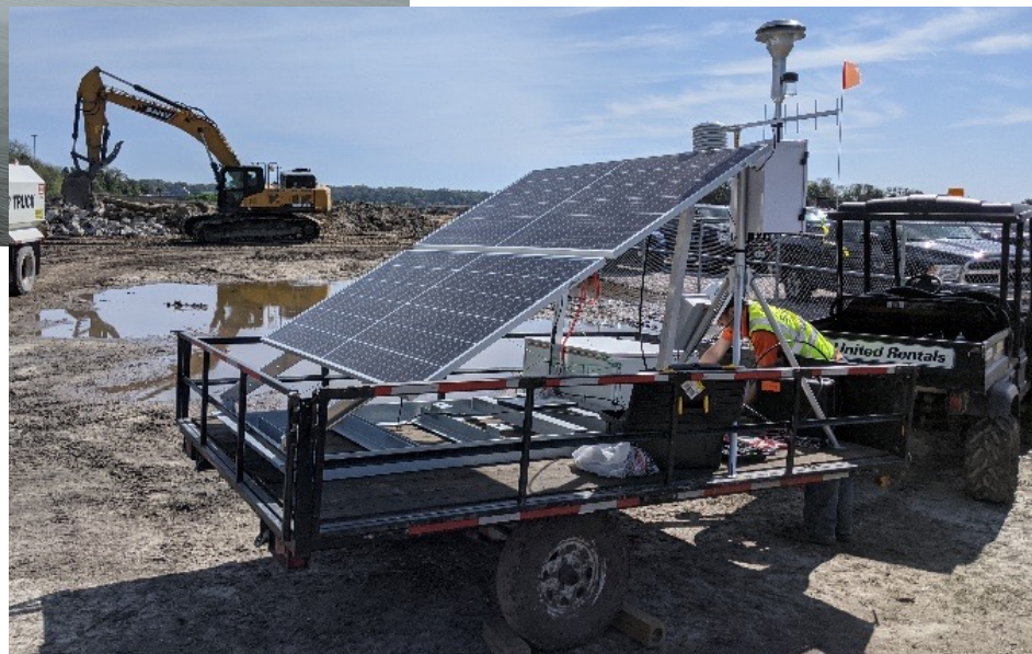
Right. This mobile real-time air monitor will capture emissions from active construction areas during the cleanup work planned to begin in 2023. Three additional air monitors positioned at fixed locations on the Site perimeter will measure dust particles in the air.