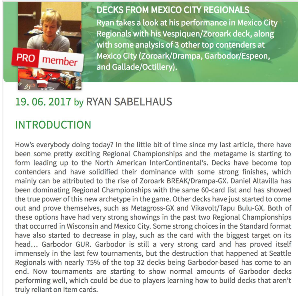
Figure 4: Screenshot of Ryan's post on 60cards.net